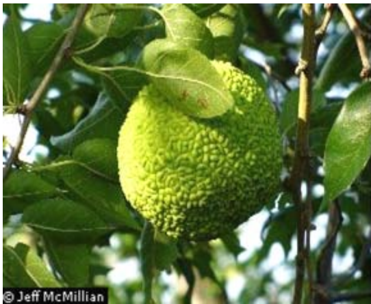
Figure 1. Fruit and leaf of Osage orange plant from the PLANTS Database website.

Contributed by: USDA NRCS Plant Materials Center Manhattan, Kansas