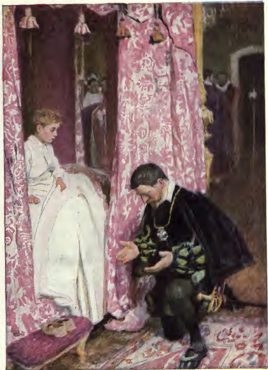
"THE RICHLY CLAD FIRST LORD OF THE BEDCHAMBER WAS KNEELING BY HIS COUCH"