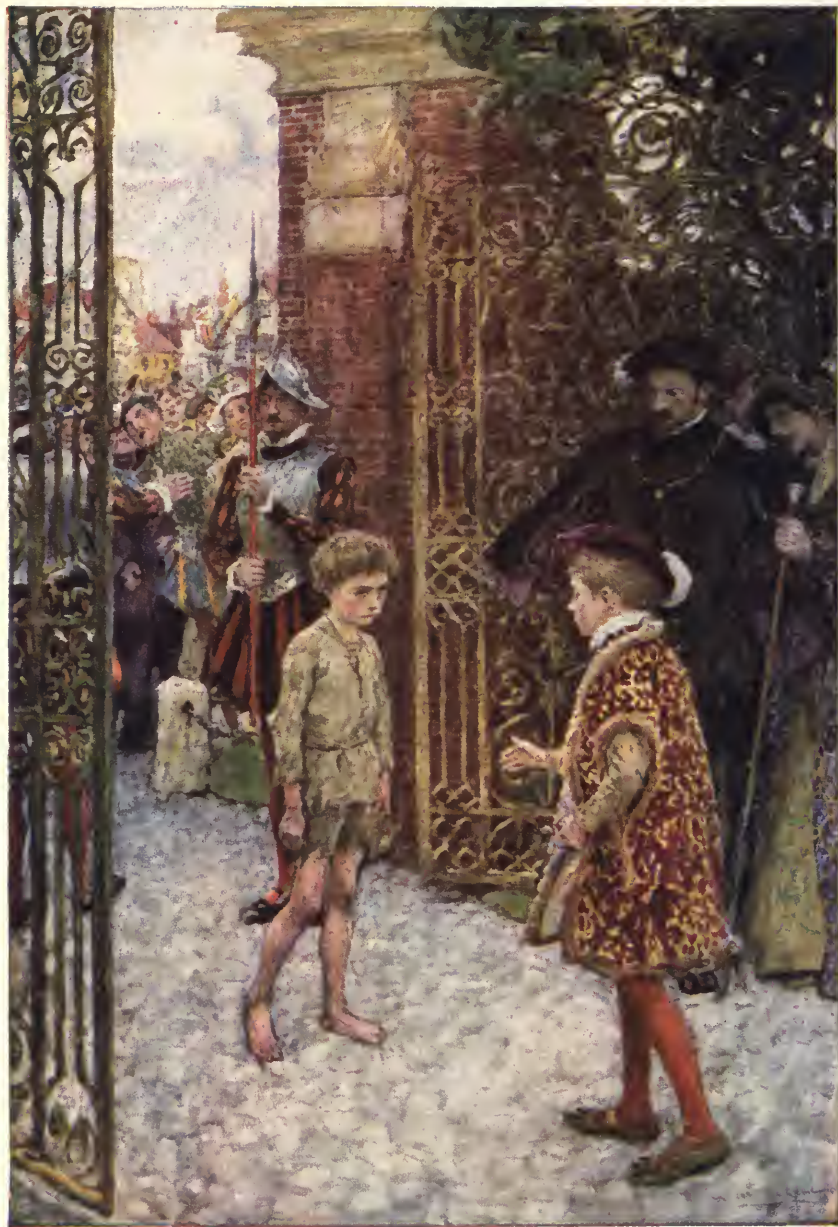
"THE LITTLE PRINCE OF POVERTY PASSED IN"