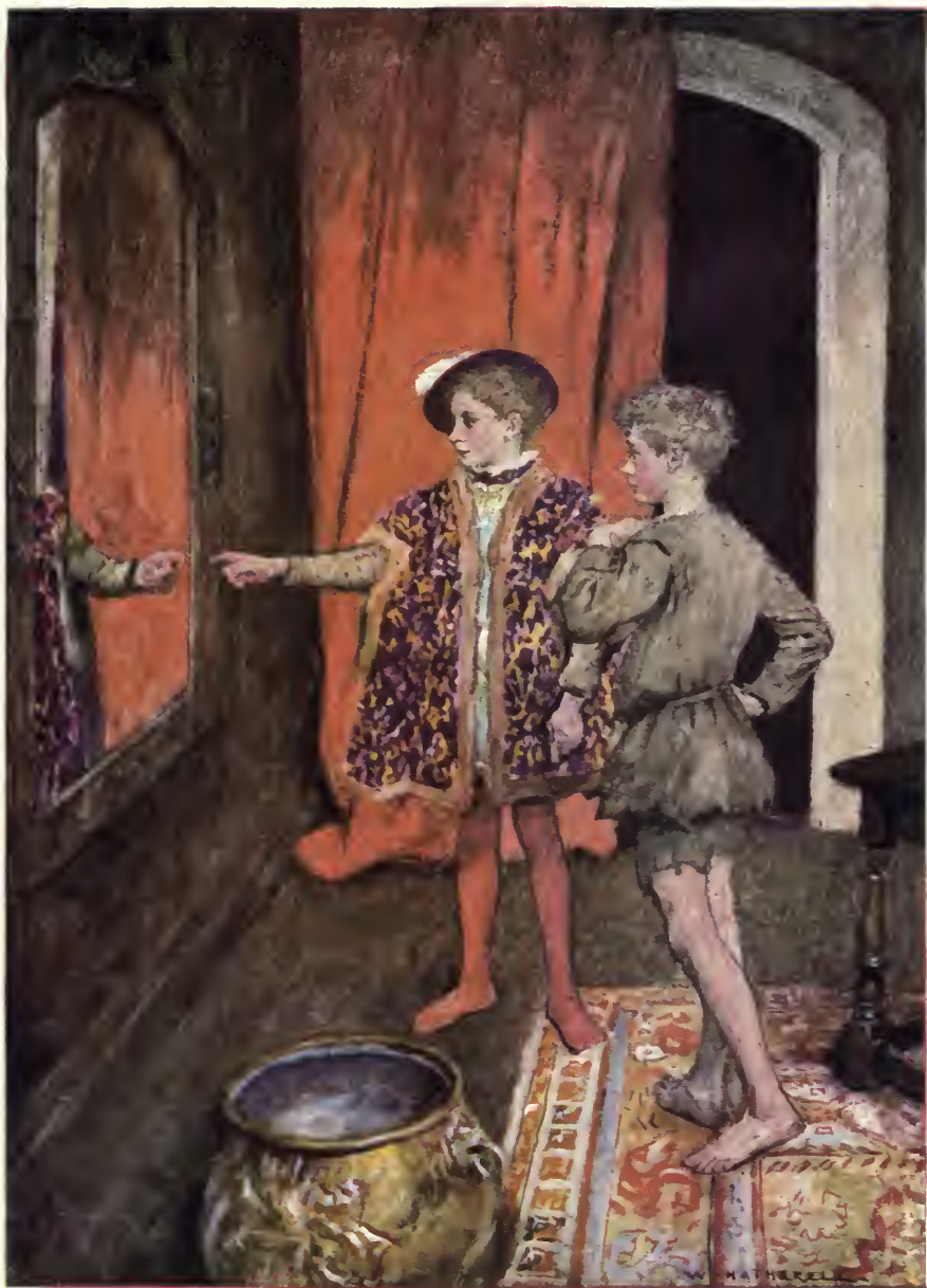
"THE TWO WENT AND STOOD SIDE BY SIDE BEFORE A GREAT MIRROR"