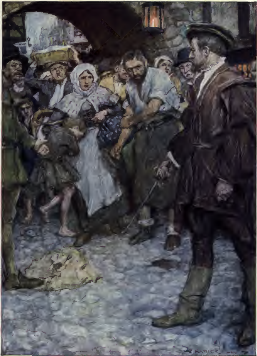
"LOOSE THY HOLD FROM THE BOY, GOOD WIFE"