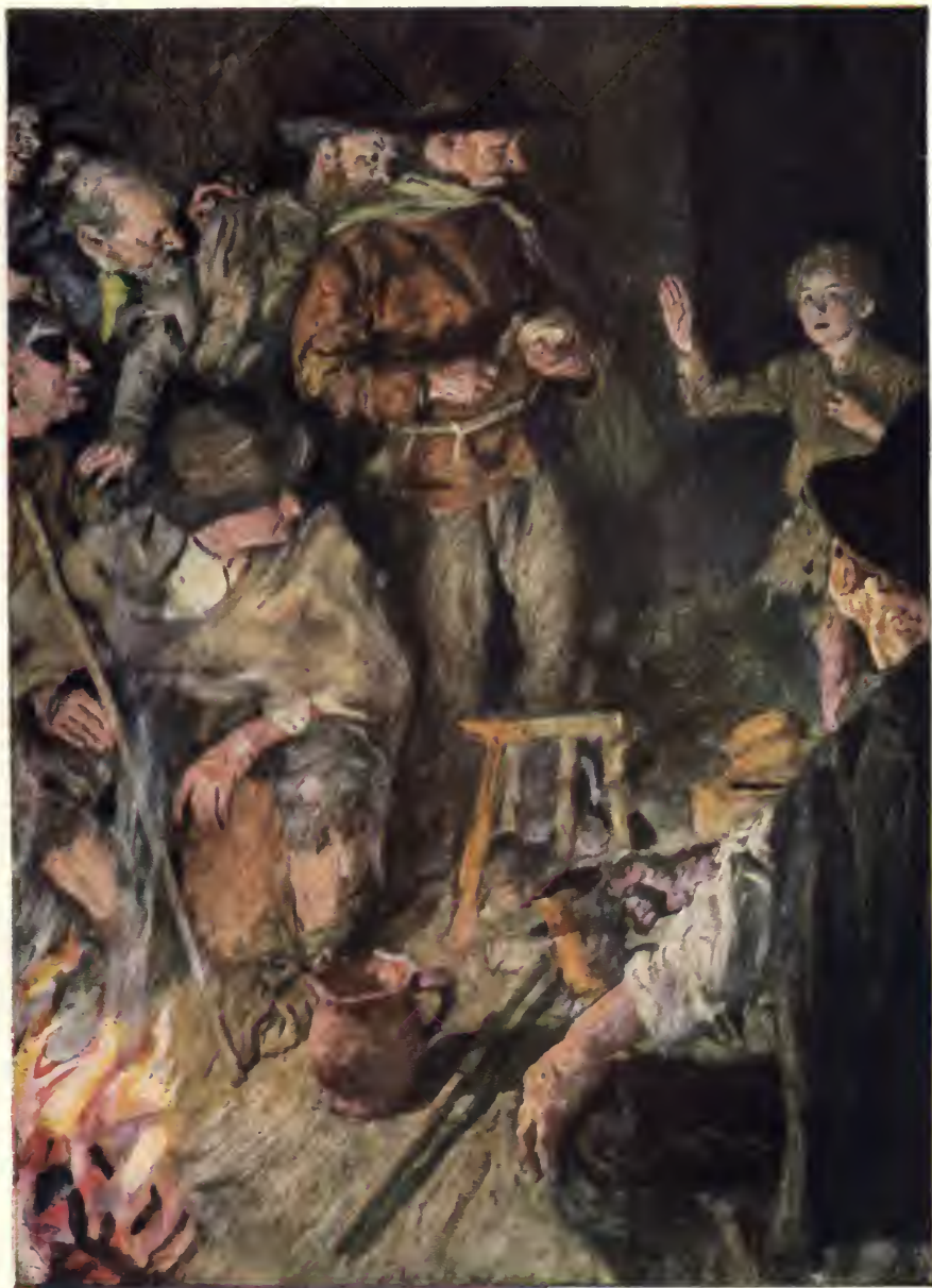
"I AM EDWARD, KING OF ENGLAND"