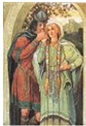
The Parting of Sir Tristram and la Belle