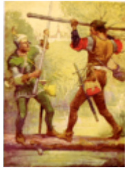
Robin Hood and Little John