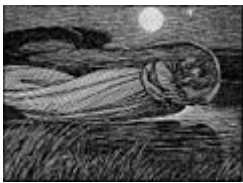
The Lady of the Lake Steals Lancelot from Alfred Tennyson, Idylls of the King , NYC 1898