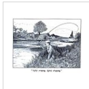
Softly Creeping, Lightly Dropping - Louis Rhead 1902 from The Speckled Brook Trout