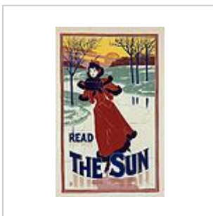
Advertising poster for the "Sun" newspaper (NYC) 1900. (btw.: This woman wears a muff)