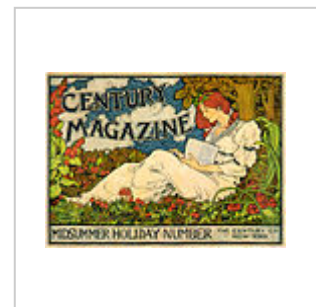
Century Magazine 1894