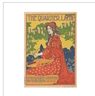
The Quartier Latin Années 1890