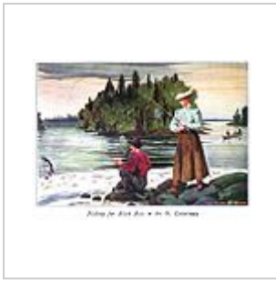
Fly Fishing For Black Bass on the St Lawrence