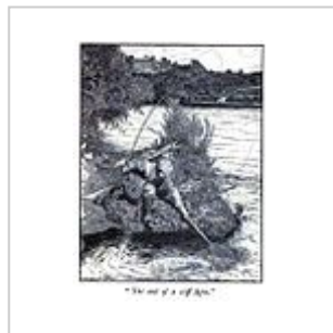
The End of a Stiff Fight - Louis Rhead 1902 from The Speckled Brook Trout