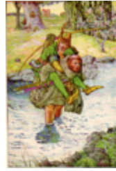
The friar took Robin on his back