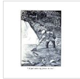
A Pool Where The Big Fellows Lie Low - Louis Rhead 1902 from The Speckled Brook Trout