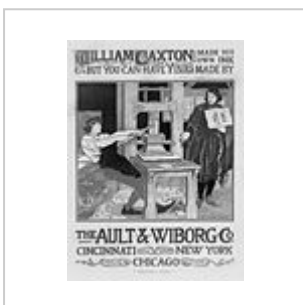
Affiche publicitaire pour une encre d'imprimerie 1896