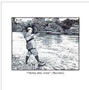
Dashing Down The Stream - Louis Rhead 1902 from The Speckled Brook Trout