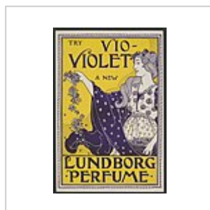
Lundborg perfume promotional poster Between 1800-1992