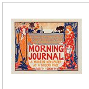
Poster for the "Morning Journal"