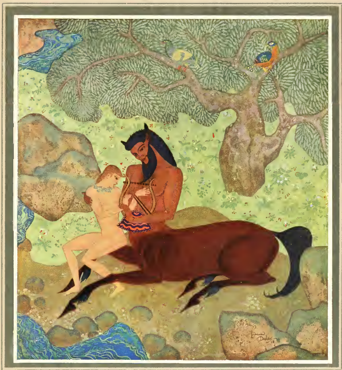
The good Chiron taught his pupils how to play upon the harp.