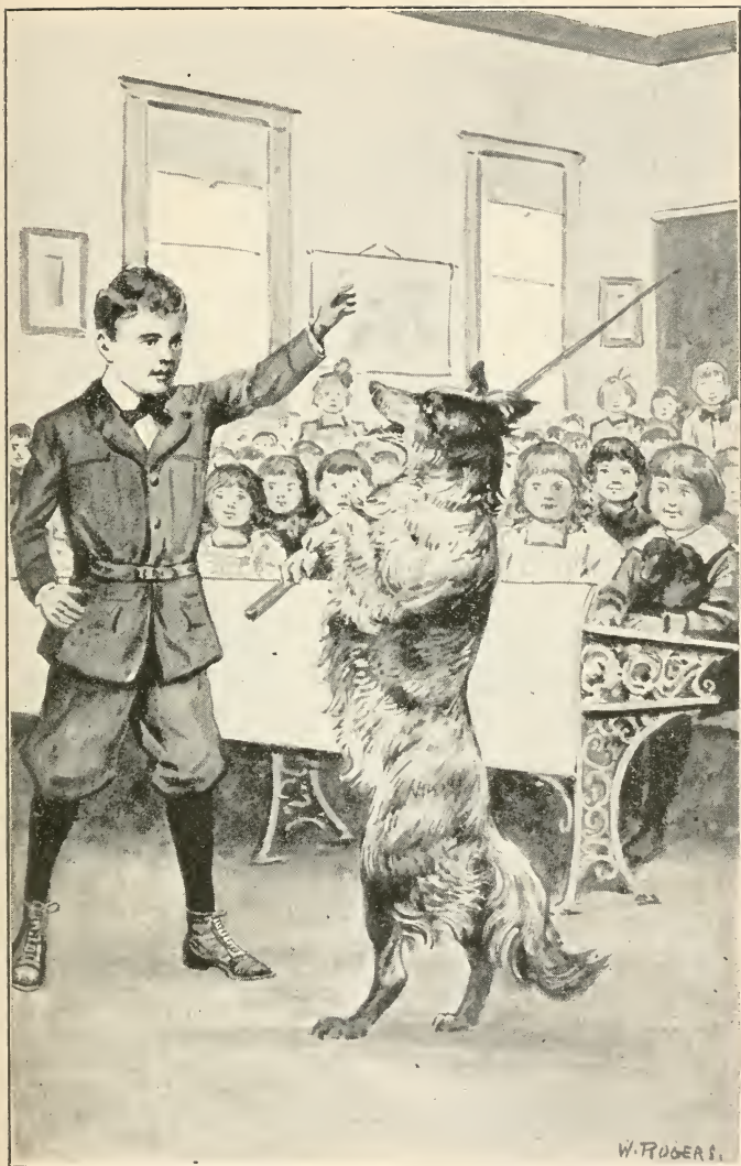
SNAP STOOD UP ON HIS HIND LEGS. —Page 70. The Bobbsey Twins at Home.