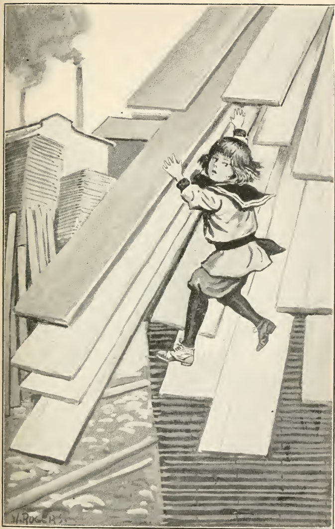
WITH A CRASH THE TOP OF THE LUMBER PILE SLID OVER, CARRYING FREDDIE WITH IT. —Page 114. The Bobbsey Twins at Home.