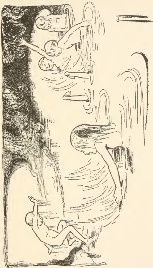
Eddie Grote was in a tight place.