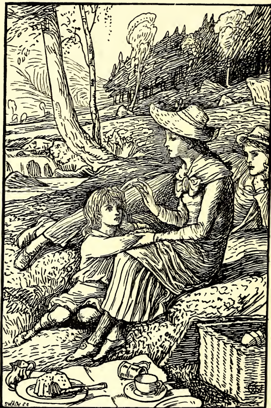
"The Story of Sunny."—Frontispiece.