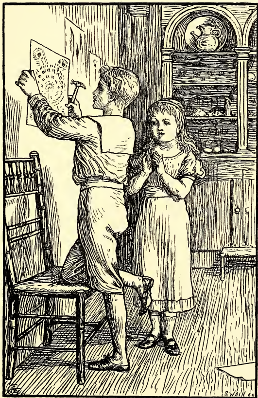
“They were neatly tacked on to the feather card, which had a very fine effect on the wall of the museum.”—P. 170.