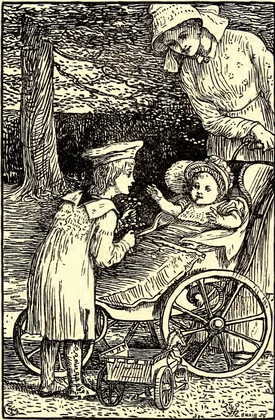
“Baby showed, or Ted thought she did, a quite extraordinary love for the bouquets her little brother arranged for her.”—P. 98.