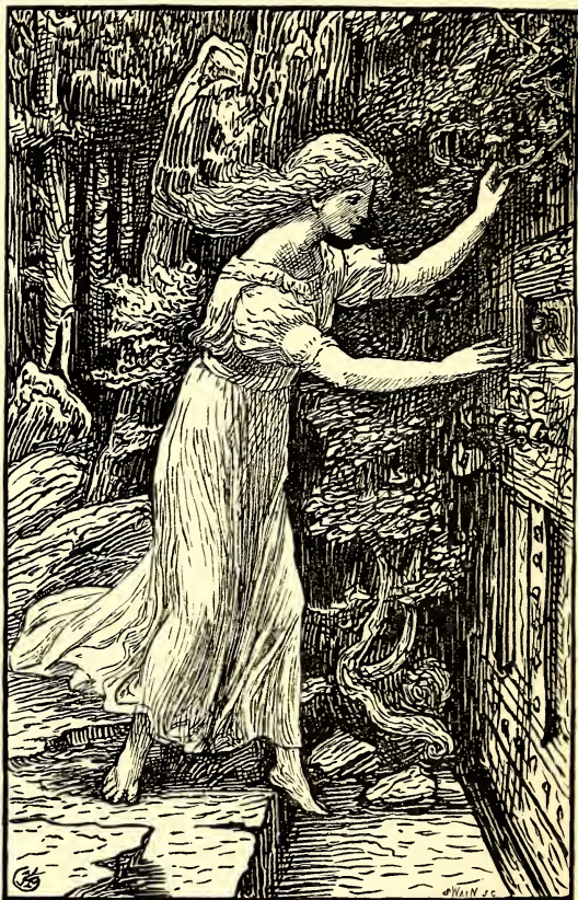
“She hunted about among the leaves and branches till she found a little silver knob.”—P. 83.