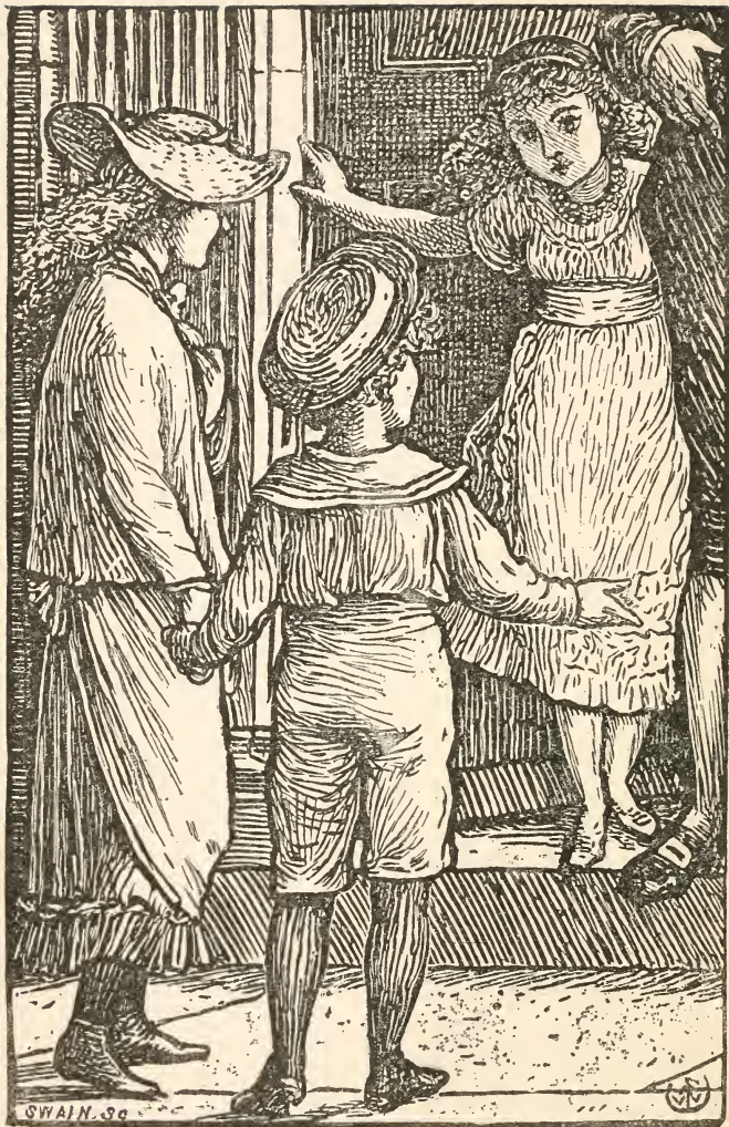
“IT IS FLOSSIE AND ME SYBIL—DON'T YOU REMEMBER US?”—Page 165.