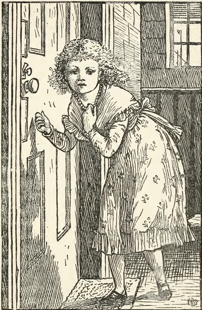
FLOSS TAPPED AT THE DOOR. "CARROTS," SHE SAID, "ARE YOU THERE?"—Page 71.