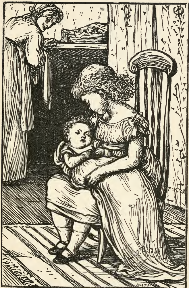
THERE SHE SAT, AS STILL AS A MOUSE, HOLDING HER PRECIOUS BURDEN.—Page 8.