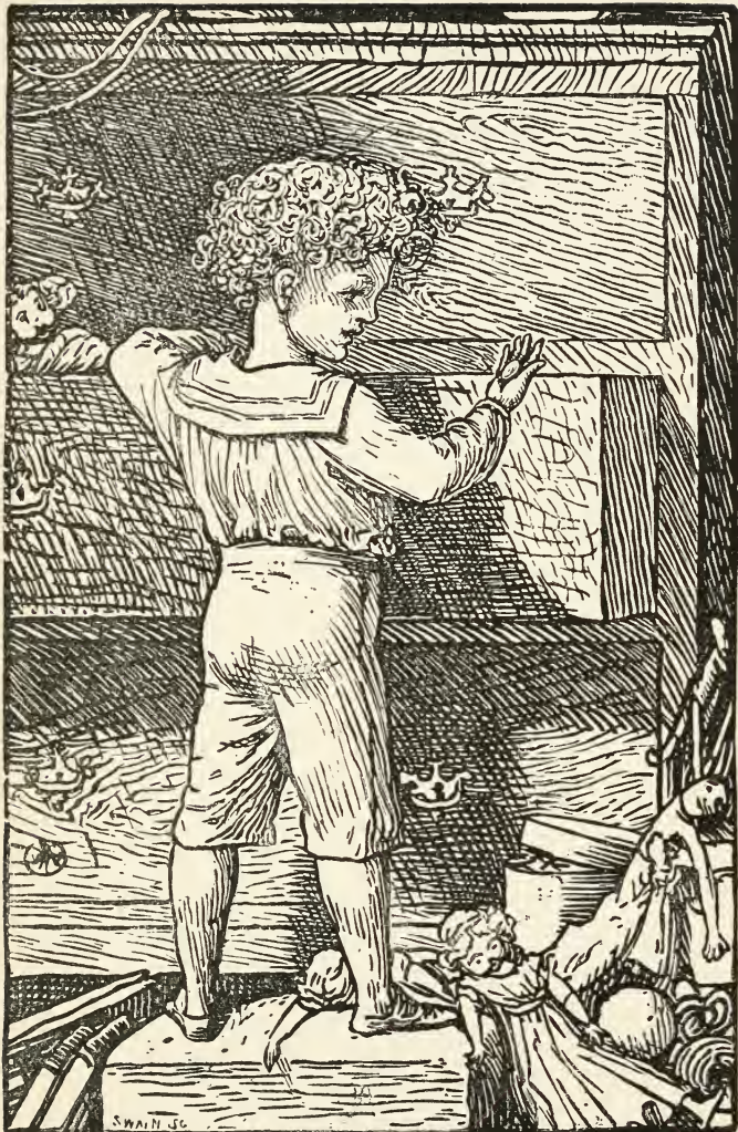
"A YELLOW SIXPENNY, OH, HOW NICE!"—Page 34.