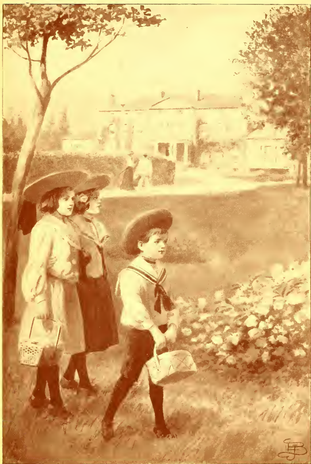
IN THE GOVERNMENT HOUSE GROUNDS