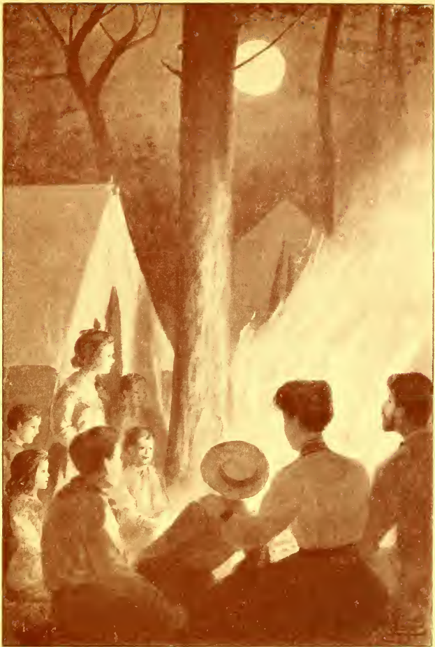
“ A GREAT BONFIRE WAS BUILT ”