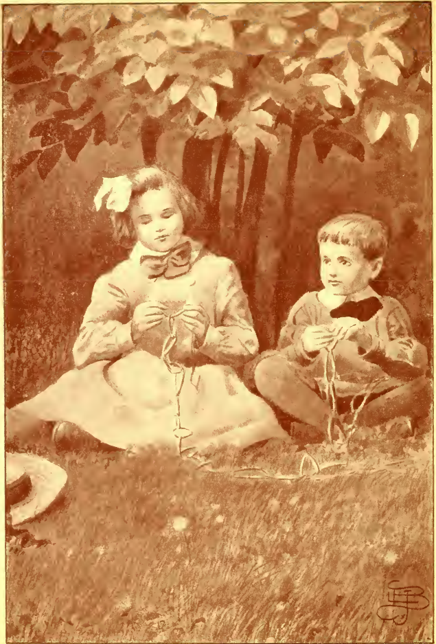
“ TWO CHILDREN SAT ON THE GRASS UNDER THE LILACS ” (See page 2)