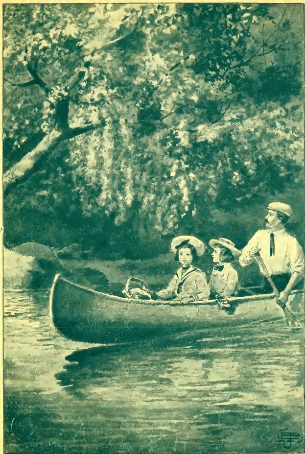
“THE TREE-CLAD SHORES WORE A FAIRY GLAMOUR”