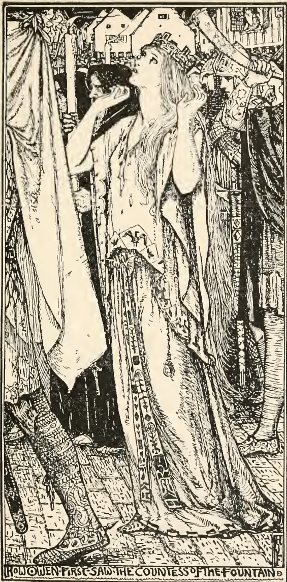
HOW OWEN FIRST SAW THE COUNTESS OF THE FOUNTAIN