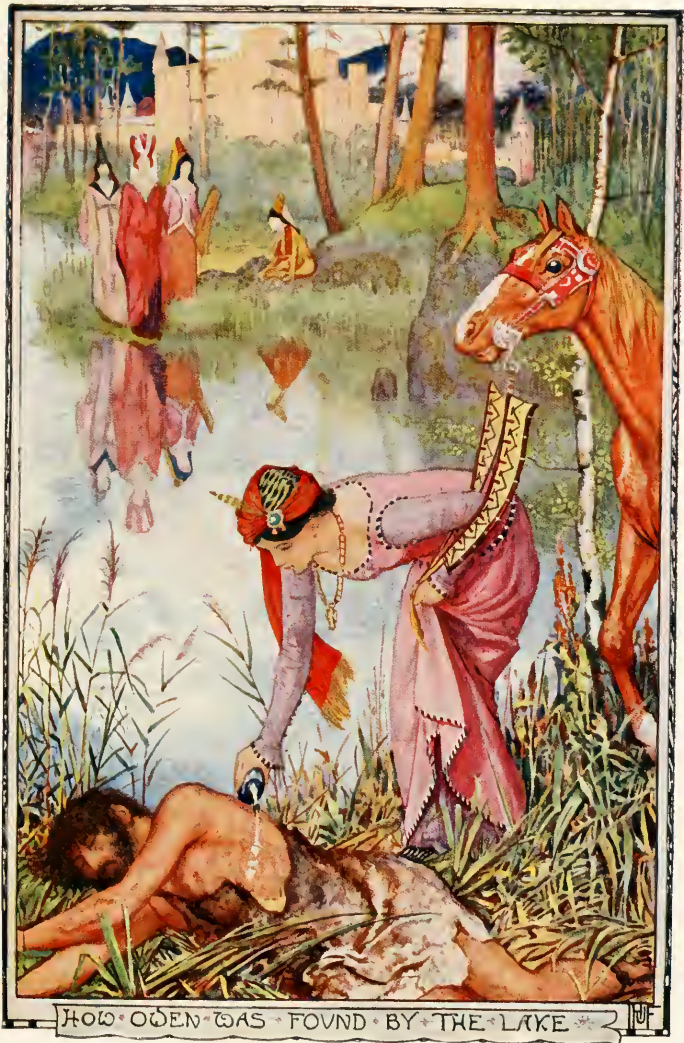
HOW ODEN WAS FOUND BY THE LAKE