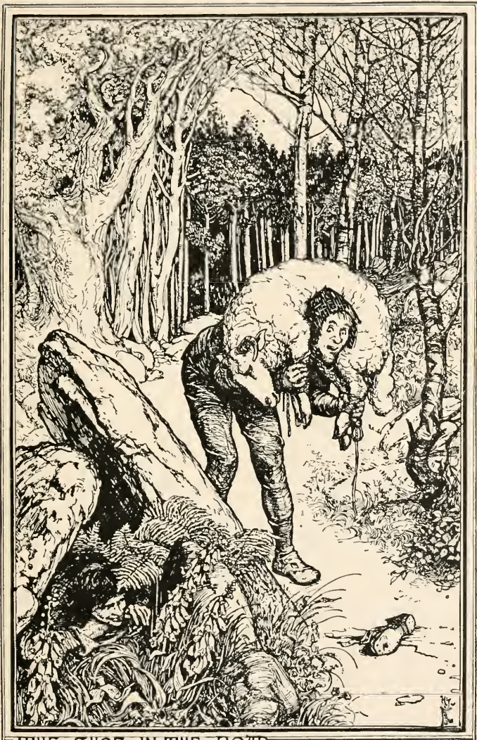
THE SHOE IN THE ROAD