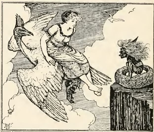
HOW BELLAH FOUND KORANDON

'I am sitting on six eggs of stone, and I shall not be set free till they are hatched.'