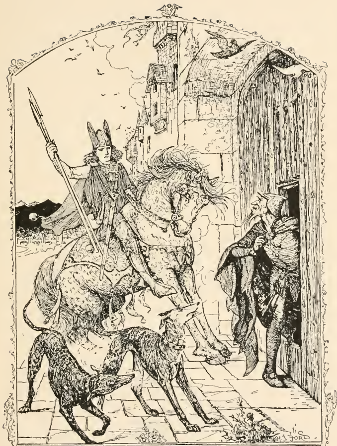
Kilueh arrives at the Gate of Arthur's Palace