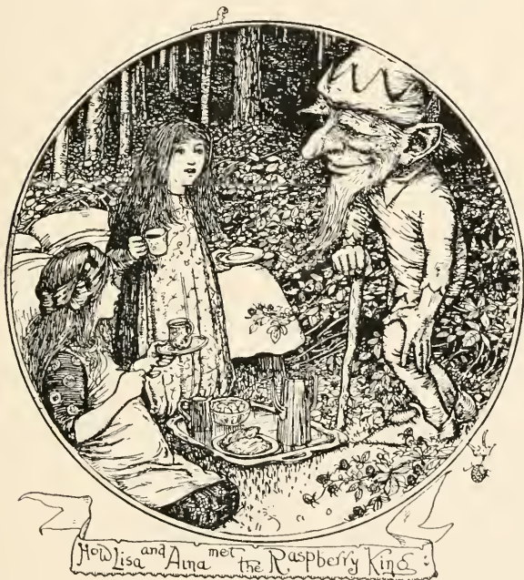
How Lisa and Ana met the Raspberry King.

Scarcely had she finished speaking when she saw beside her a little silver tray with a gilt coffee-pot, two cups of rare porcelain, a sugar basin of fine crystal, silver sugar tongs, and some good fresh white bread. The girls poured out the beautiful coffee, put in the cream