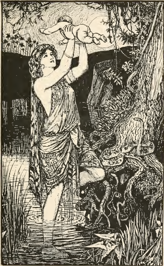
MY BABY, MY BABY !”