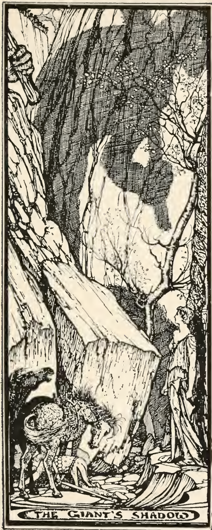
THE GIANT'S SHADOW