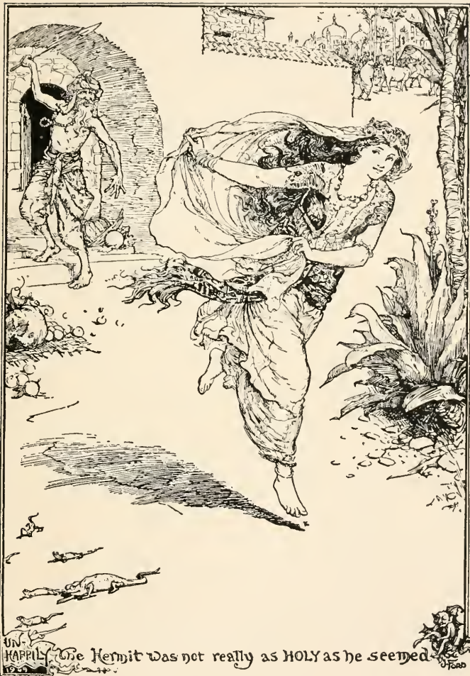
UN- HAPPILY The Hermit was not really as HOLY as he seemed.