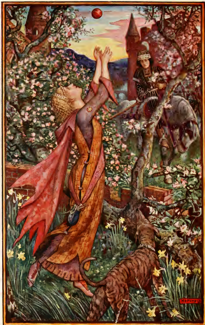
“How the King found the girl playing at ball in the orchard.”