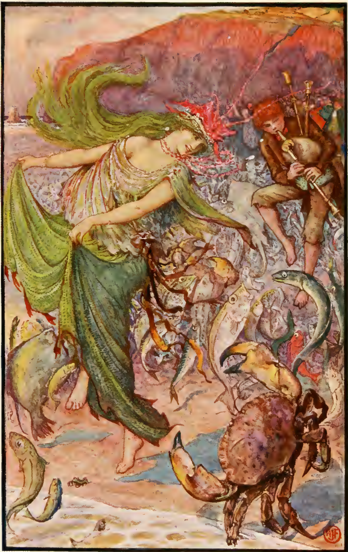
The Sea-lady allures Maurice into the Sea.