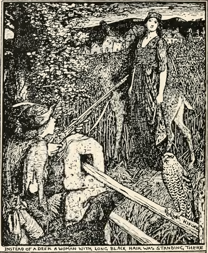
INSTEAD OF A DEER A WOMAN WITH LONG BLACK HAIR WAS STANDING, THERE

'Ah, you have a gun,' said the farmer as the young