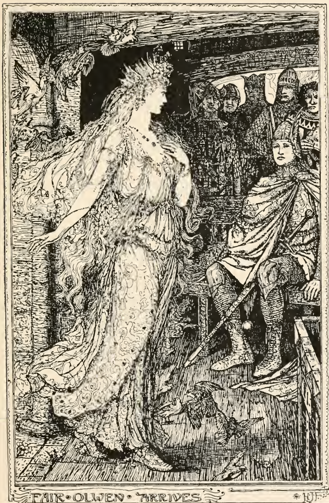
FAIR • OLWEN • ARRIVES