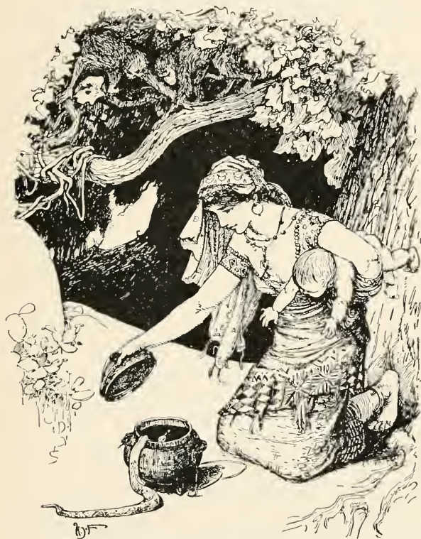
The One-handed Girl befriends a snake

'We cannot kill her,' answered they; 'if we did, our son would assuredly kill us. Let us do as the others did,