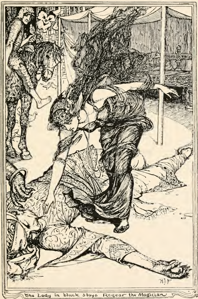
The Lady in black slays Regear the Magician