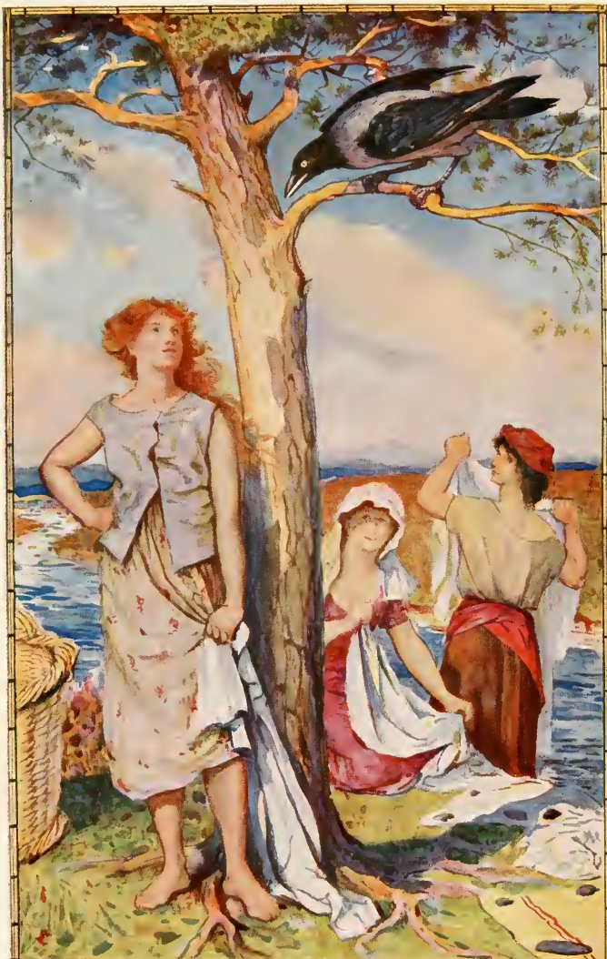
INDEED I WILL WED THEE : A PRETTY CREATURE IS THE HOODIE ~ HWF