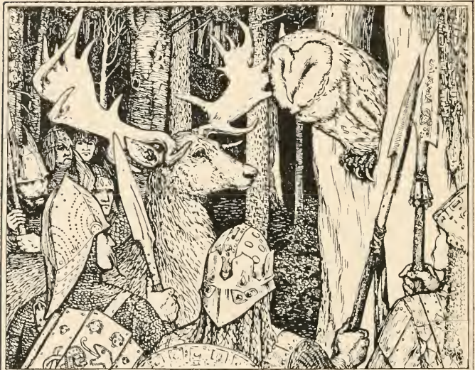
The Stag - - of Redyvre brings the Seven Companions to the Owl of - Cwm Cawlyd

not withered stumps? Yet until to-day I have never heard of the man you name. Still, I will guide you to the oldest animal in the world, and the one that has travelled most, the eagle of Gwern Abbey.' And he flew before them, as fast as his old wings would carry him, till he reached the eagle of Gwern Abbey, but when they inquired of the eagle whether he knew aught of Mabon he shook his head.