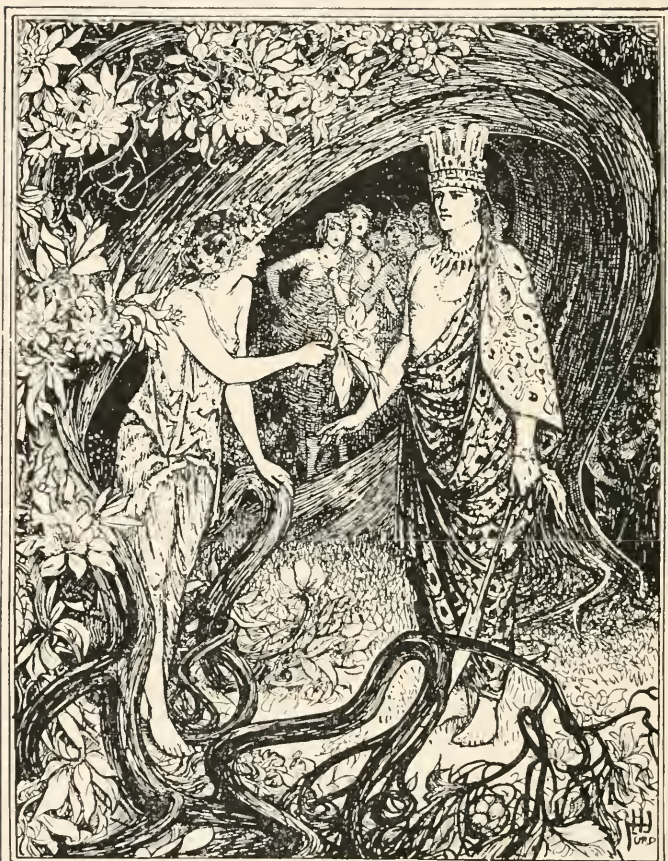
HOW THE IRON TREE BOWED DOWN AND THE GIRL GAVE OF ITS LEAVES AND FLOWERS TO THE KING.

signed to one of his attendants, who followed the path that the boy had taken to the hut.