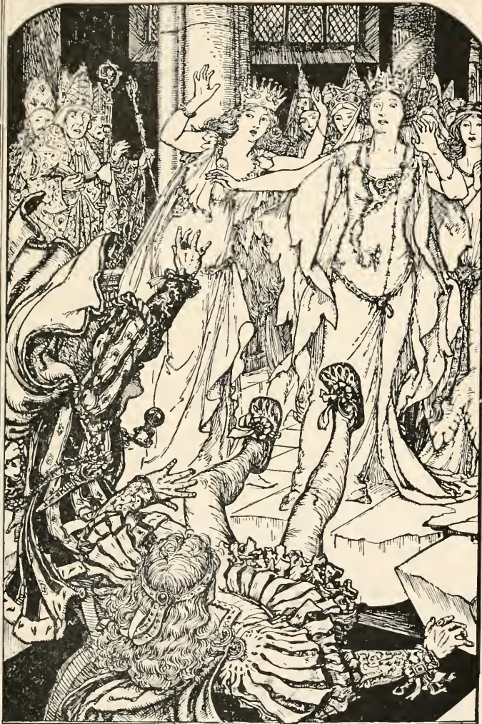
DOWN WENT THE TWO BRIDGROOMS