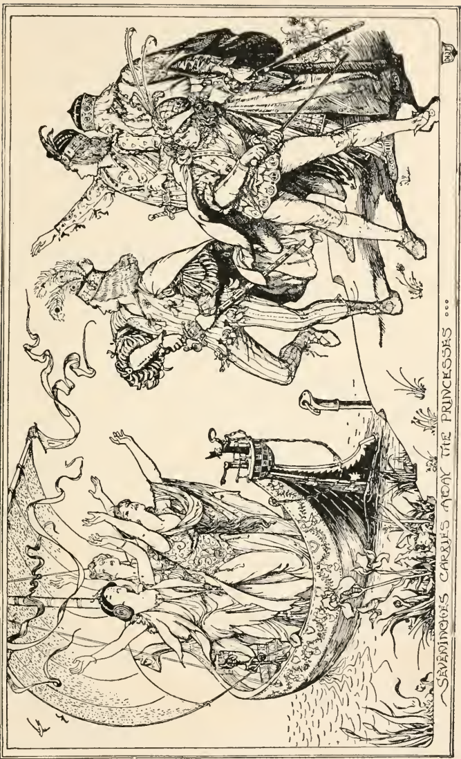
SEVERINGHOIS CARRIES AWAY THE PRINCESSSES ...