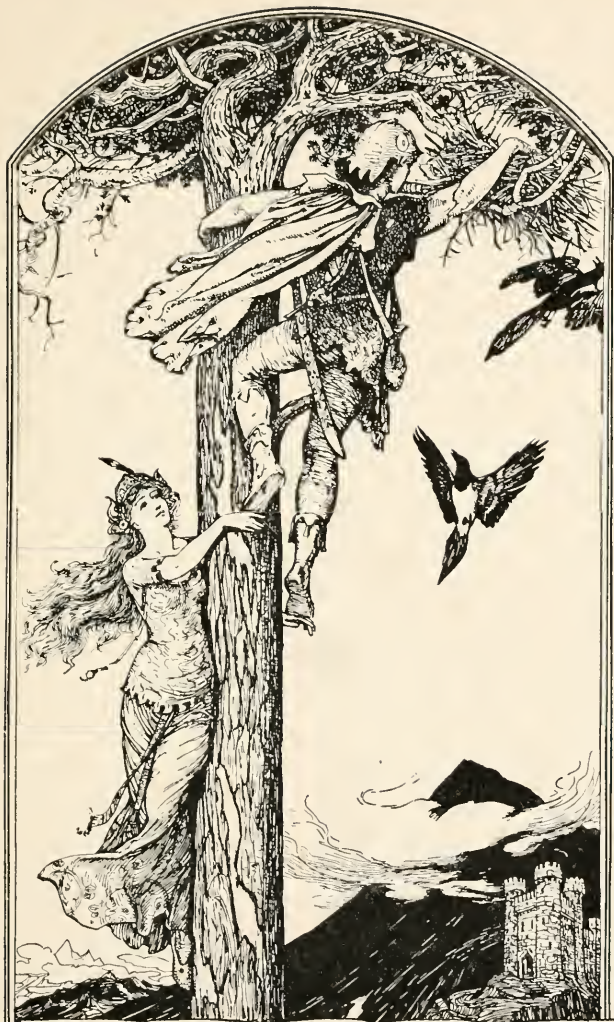
How the King's Son fetched the Magpie's Eggs