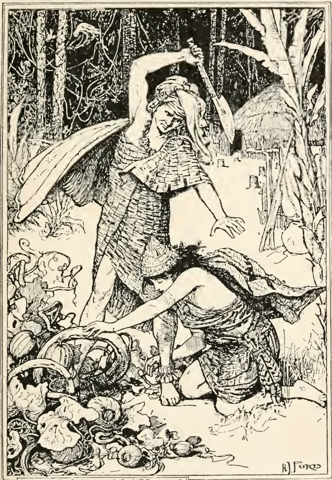
HOW THE GIRL LOST HER HAND.