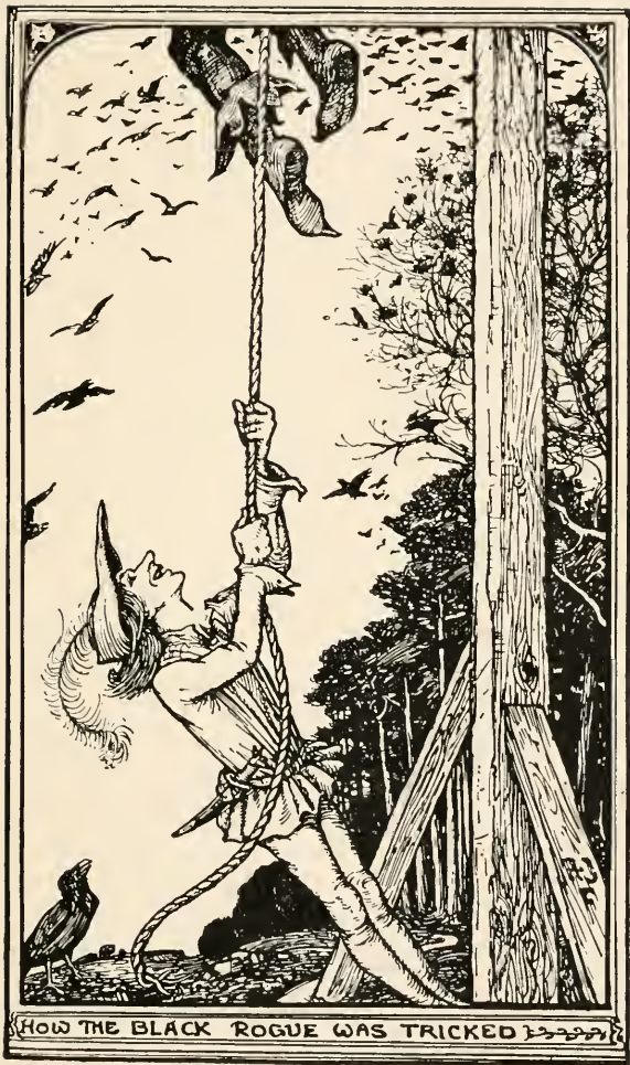
HOW THE BLACK ROGUE WAS TRICKED