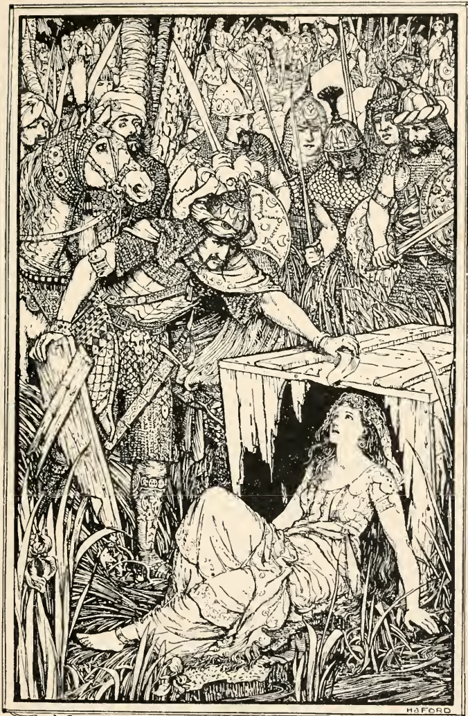
The Princess Released from the Box