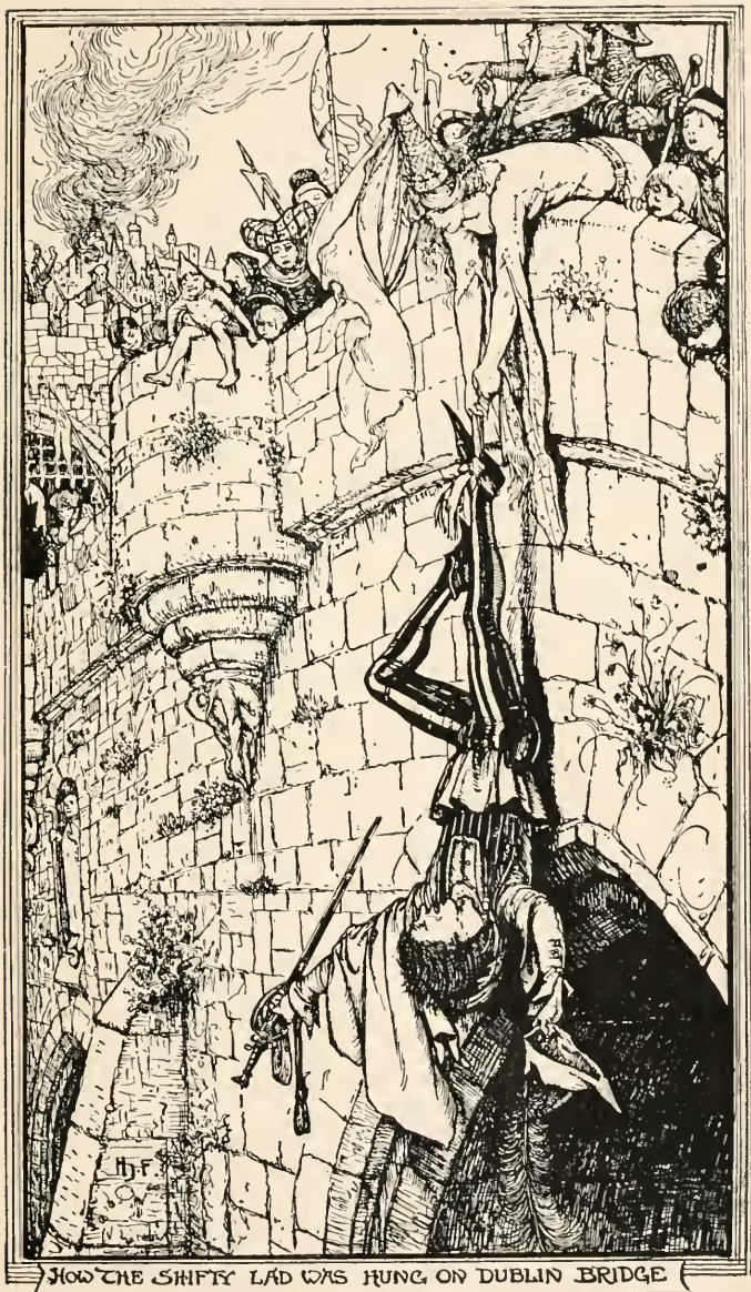
HOW THE SHIFTY LAD WAS HUNG ON DUBLIN BRIDGE