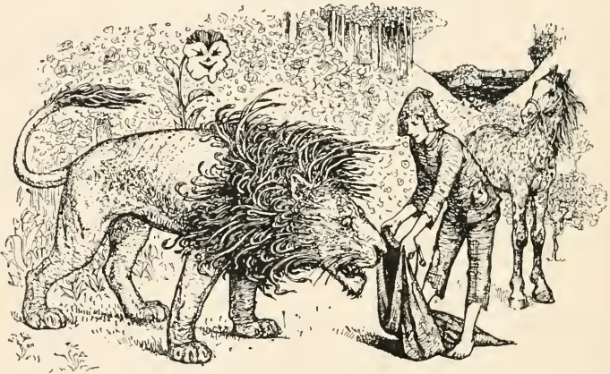
How Peronnik tricked the Viper-maned Lion with a bag

Now this was just what Peronnik had been hoping for, so he held the bag while the lion opened it care-