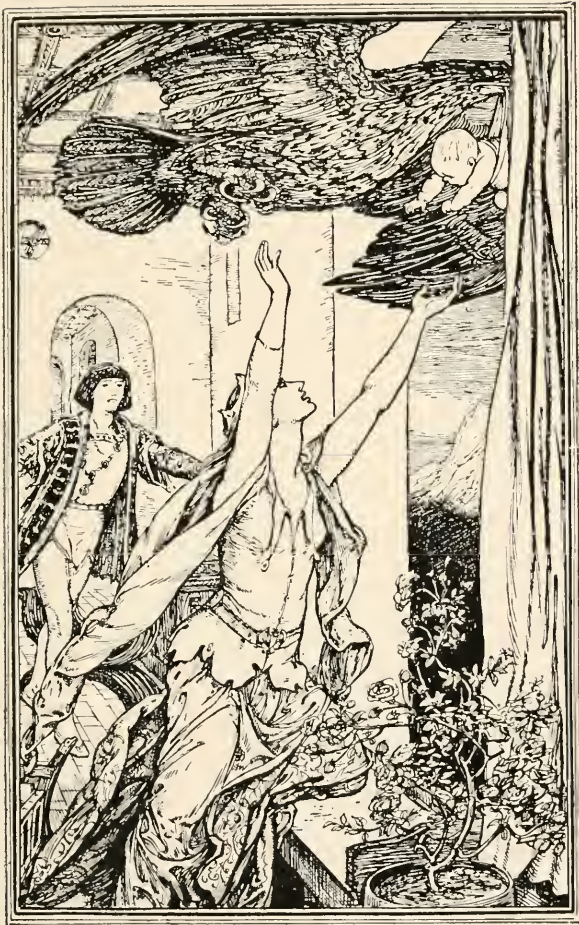
The Princess loses her first Baby .