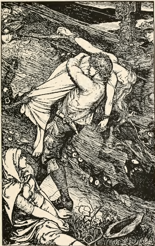
HOW JOHN GOT HIS WIFE BACK FROM THE FAIRIES