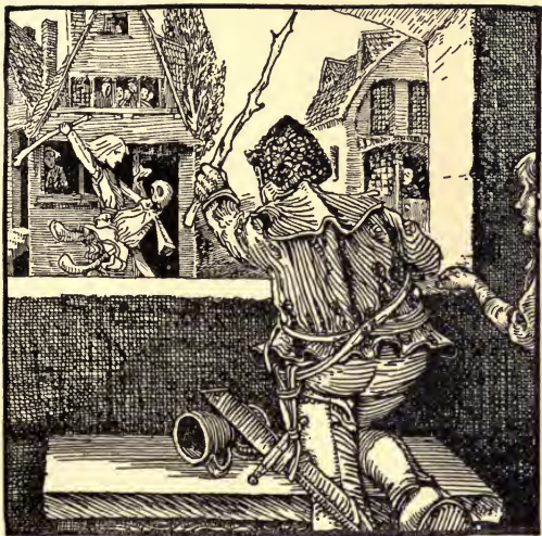
Simpleton beating the dummy before the wife-beater's house.