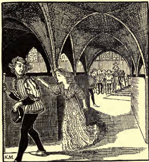
The princess insists that Larro return to finish the ceremony.