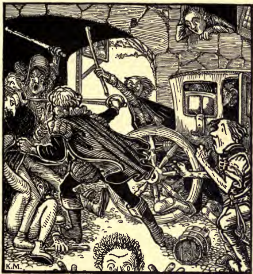
The fight in the tavern yard.