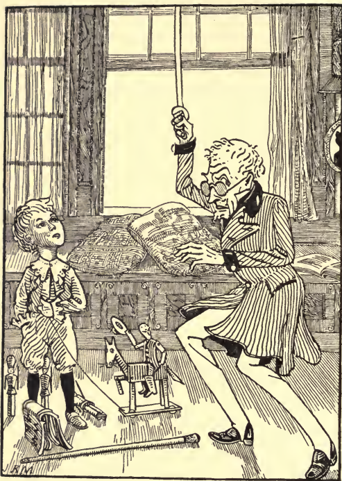
Grandfather's reminiscences of the Mexican War.