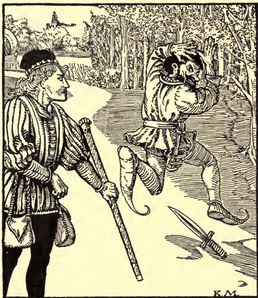
Larro, by means of his cane, puts a ruffian to flight.