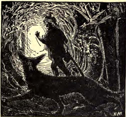
Larro, followed by the wolf, lights his way with the yellow cherry.