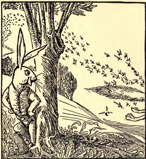
The Bees make it warm for Brer Foz