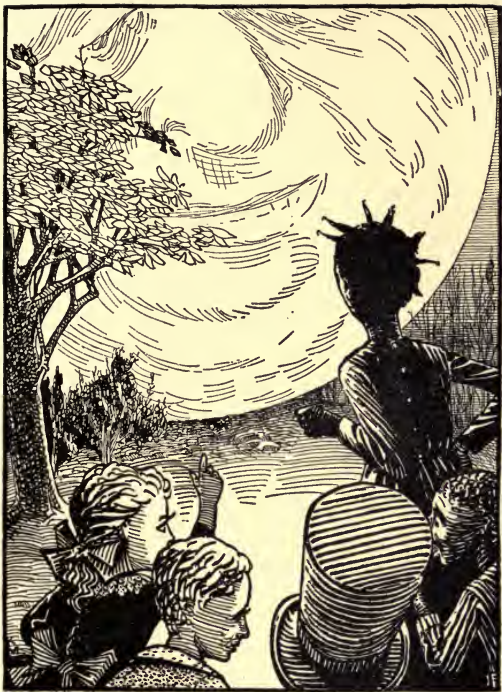
The moon settling down.