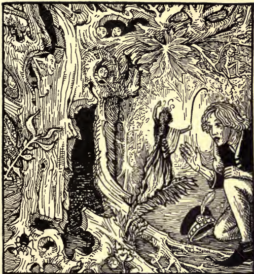
Larro and Larroline.