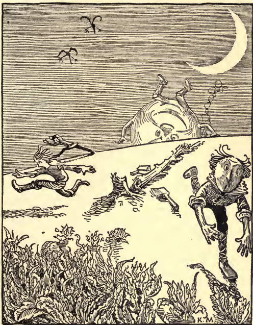
The sun takes part of a day off and comes down early.