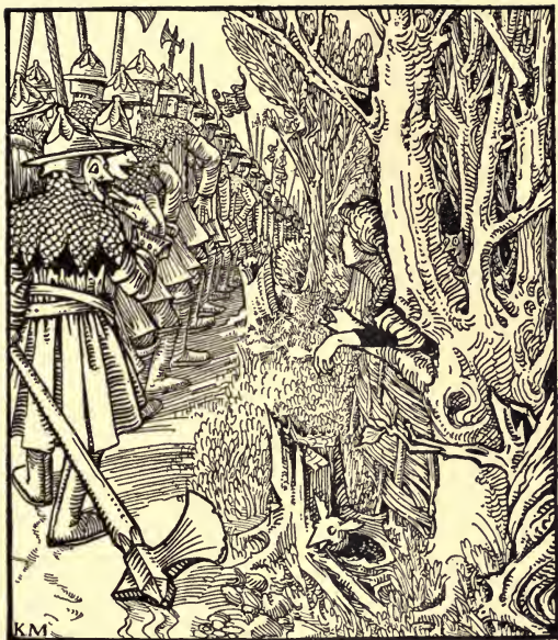
The soldiers passing.