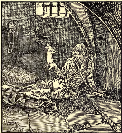
Larro, thrown into prison, is comforted by his little companion.