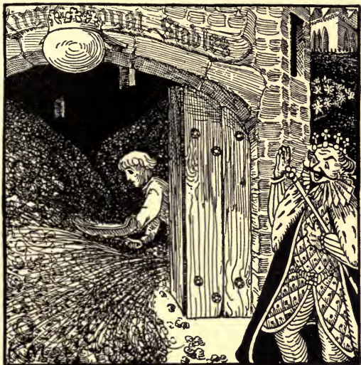
Mack at work in the stable.