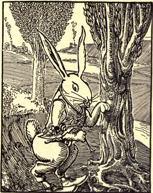
Brer Rabbit brings the bee home.