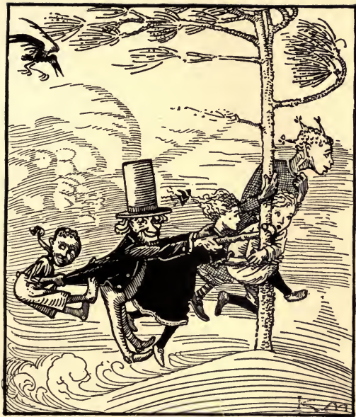
Travelling by the pine sapling.