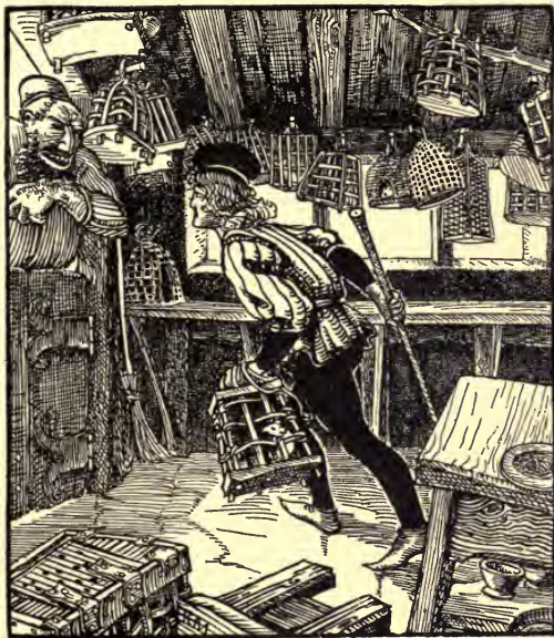
Larro rescues the mouse-princess.