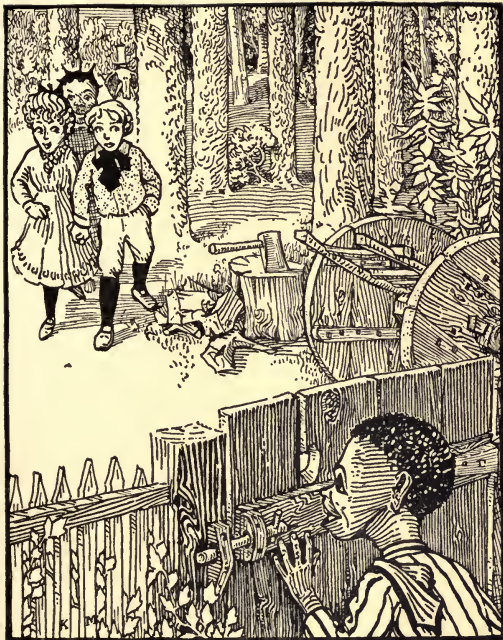
Billy Biscuit receives the three children.