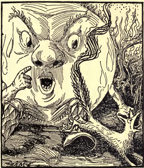
The white fox and the Sun.