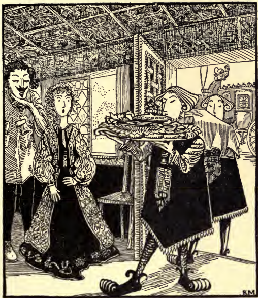
Arrival of the King's dinner.