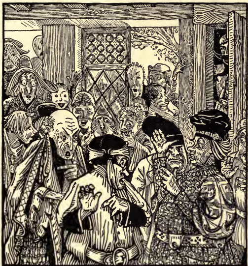
Denouncing the Mayor as a rogue.