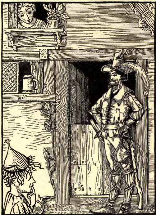
A dark stranger came to our door.