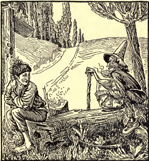
The little old man appears again.