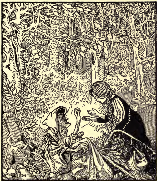
Lizette and the old woman.