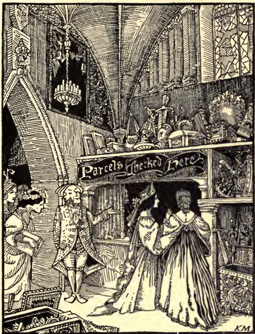
The room full of trinkets.