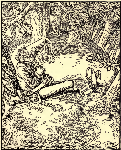
The story teller getting close to nature