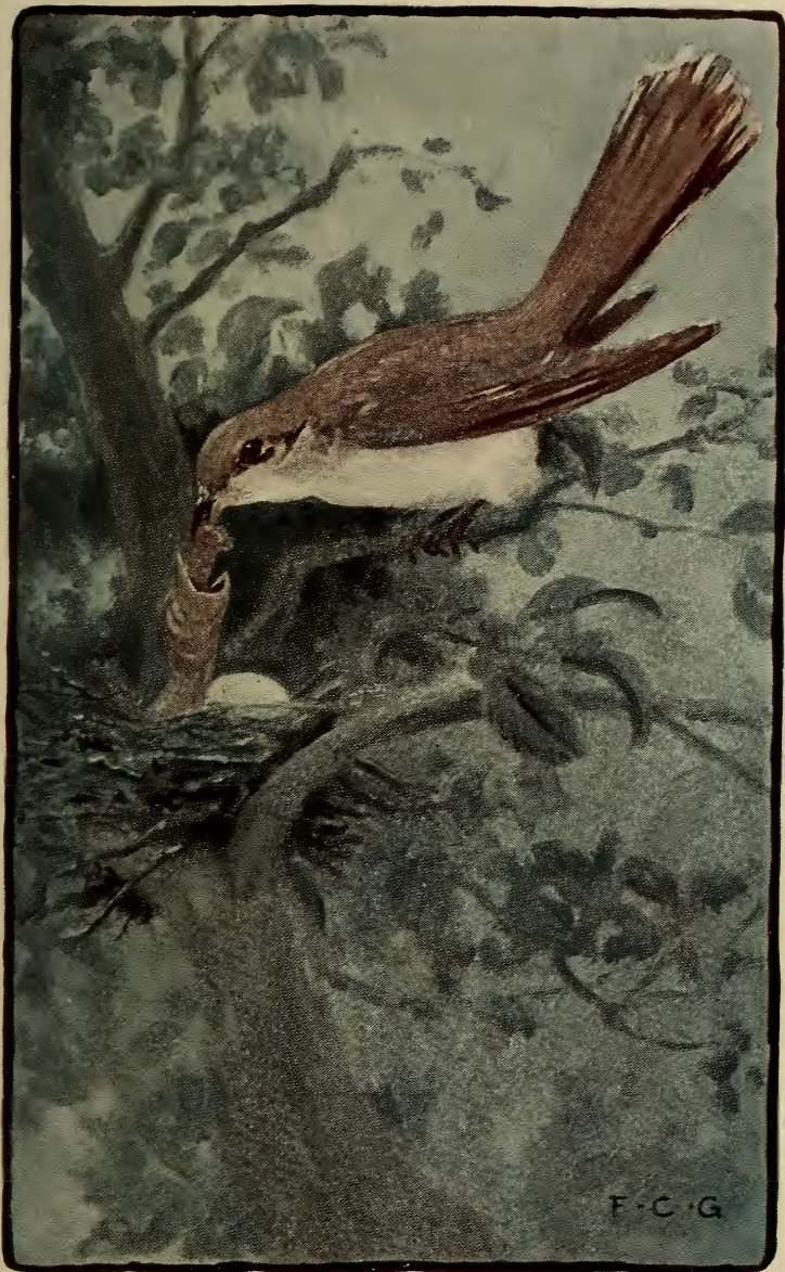
STUFFED IT DOWN THE WIDE-OPEN BILL.