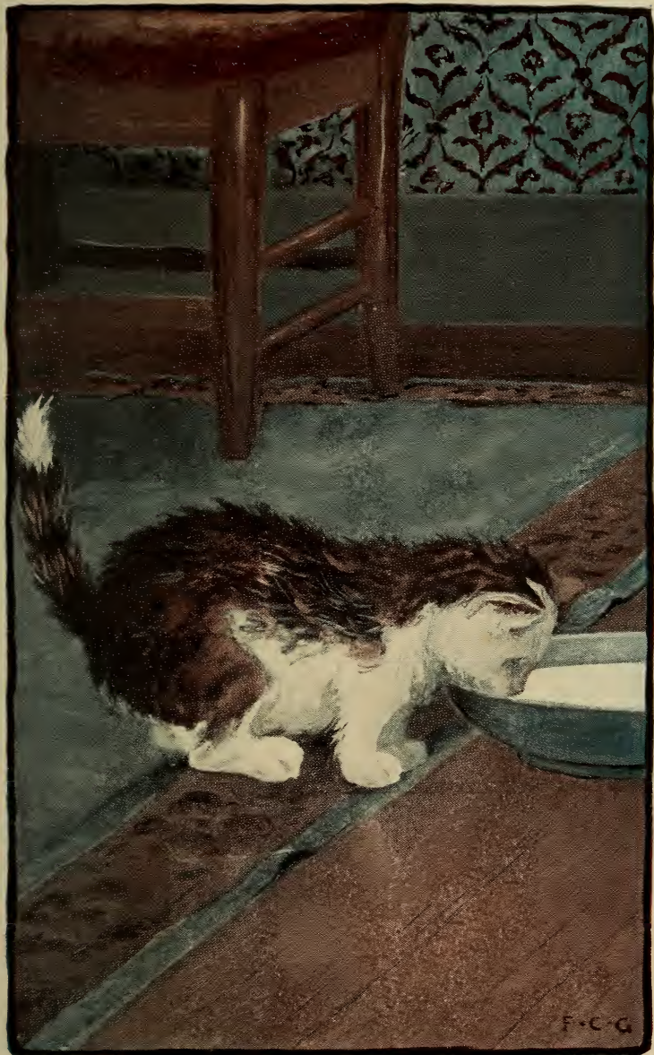
THE KITTEN LAPPED UP HIS MILK.