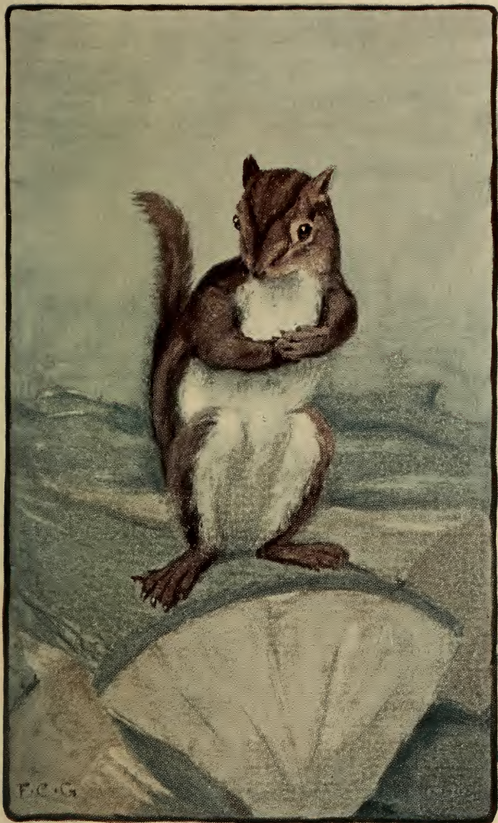
MR. CHIPMUNK ON THE WOODPILE.