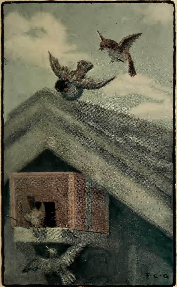
THE FIGHT FOR THE BIRD HOUSE.