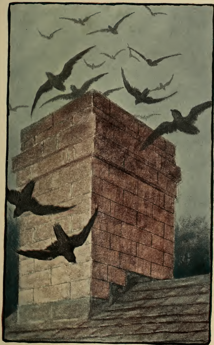
THE CHIMNEY-SWIFT'S HOME.