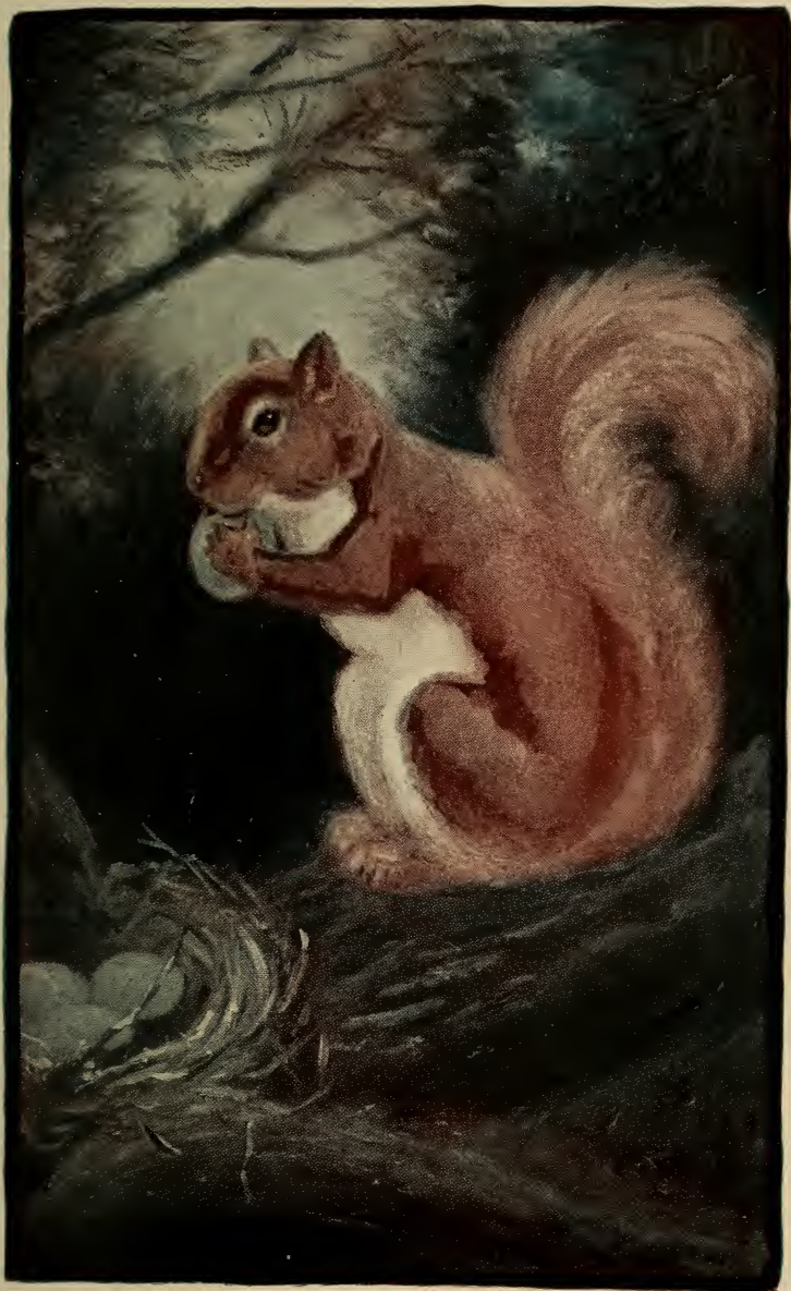
A RED SQUIRREL ATE THEM.