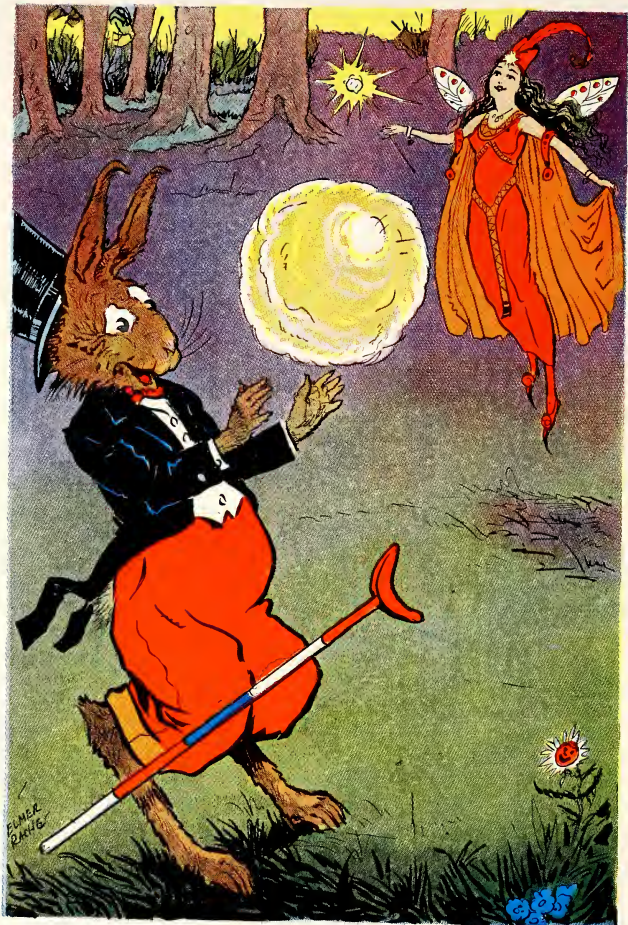
He had to drop his crutch to catch the golden ball. (See page 128.)