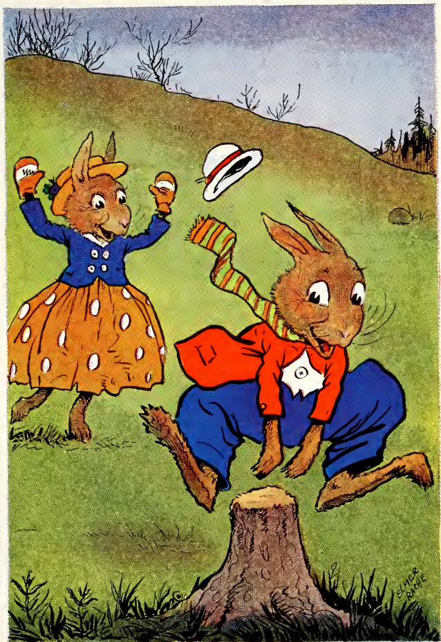
They ran along and had a jolly time. (See page 43.)