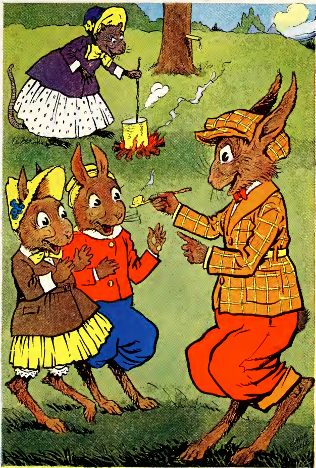
“Eat this,” Uncle Wiggily said to Sammie and Susie. (See page 95.)