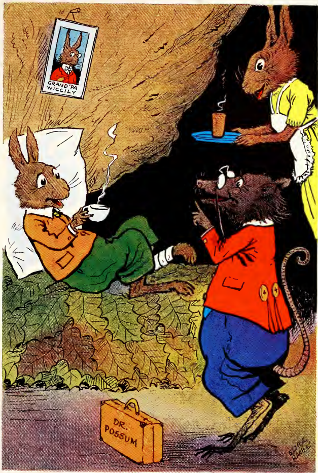
Dr. Possum told Sammie he would have to stay in until his leg was better. (See page 17.)