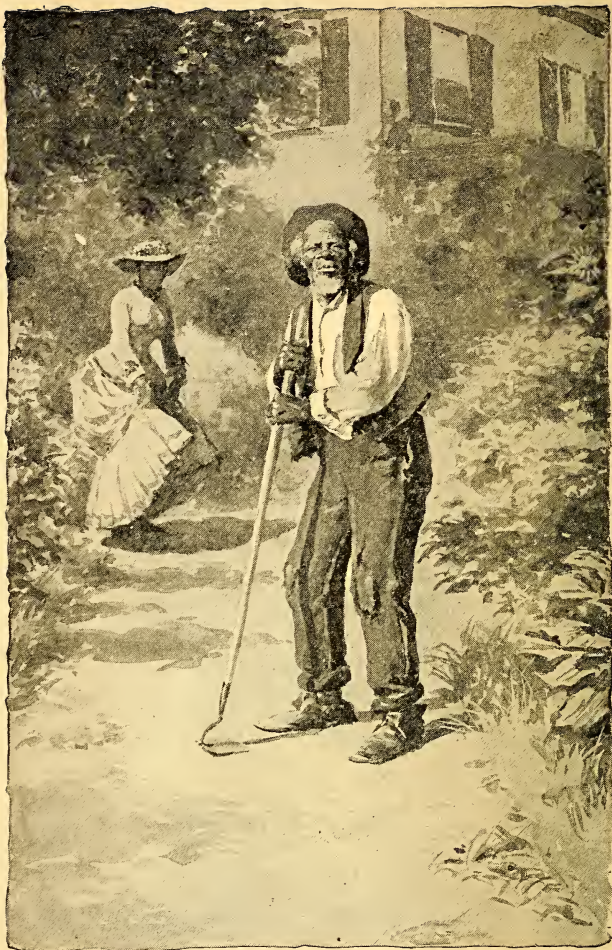
UNCLE REMUS . . . SNIFFING THE AIR. Page 258.