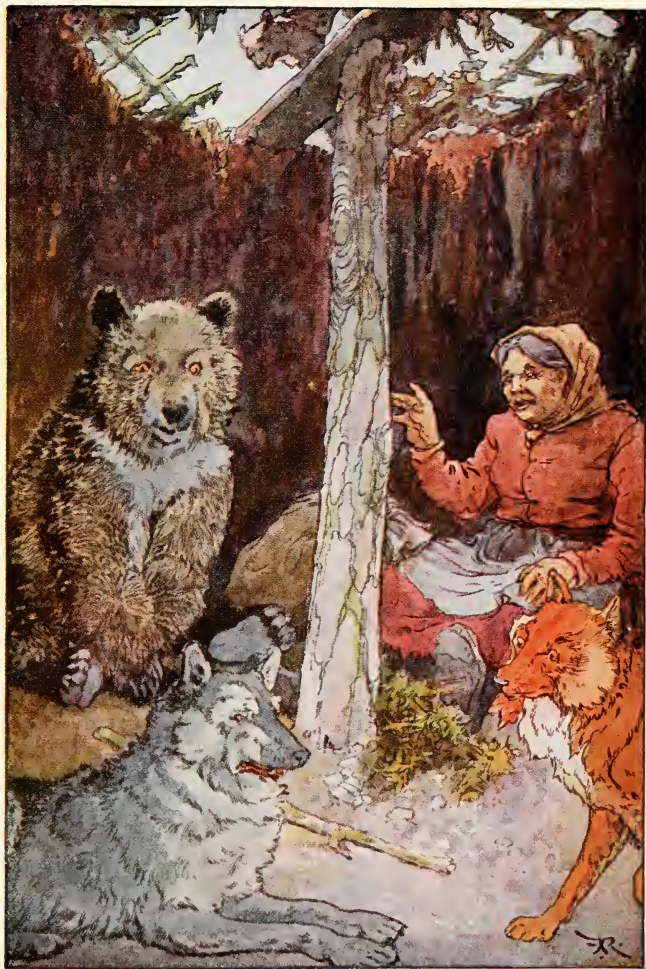
Look at Father Bruin himself in the corner