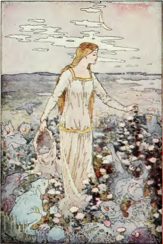
The Princess began to pluck and gather as fast as she could