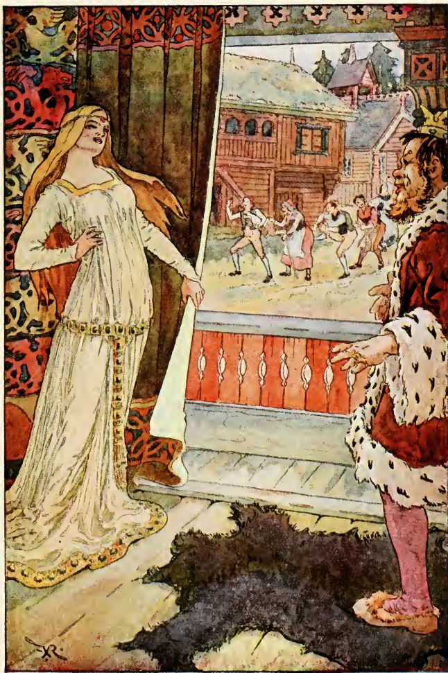
She opened her mouth wide and laughed