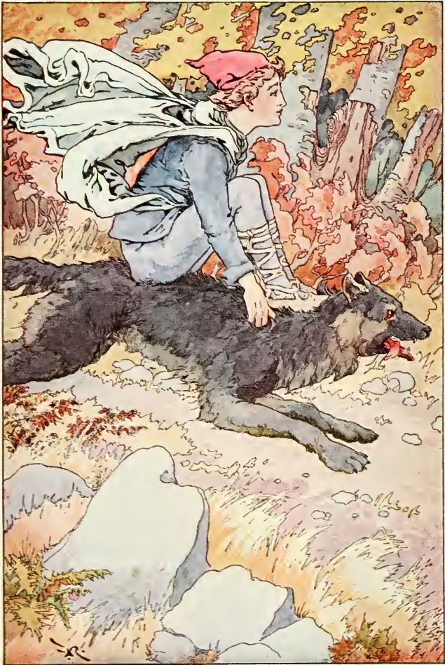
Never had the prince had such a ride in his life