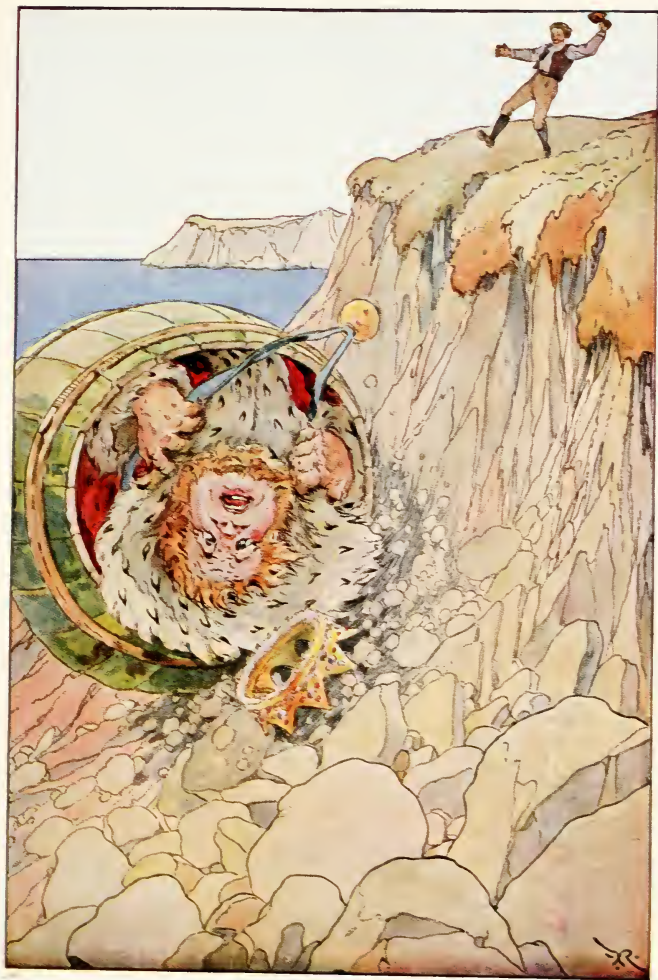
So he stuffed the King into the barrel and rolled him over