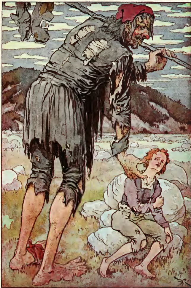
The lad had to look up, right up into the sky