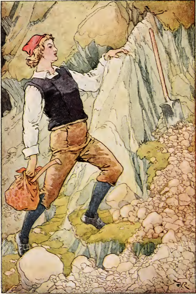
A spade that stood digging and delving