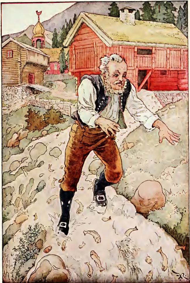
With the herrings and broth at his heel