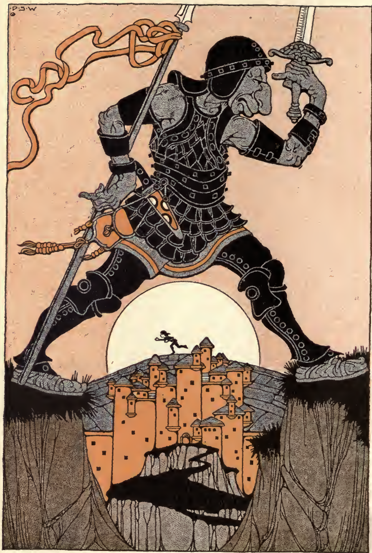
Round and round the Castle they went and the Giant with his strength was wearing out Feet-in-the-Ashes.