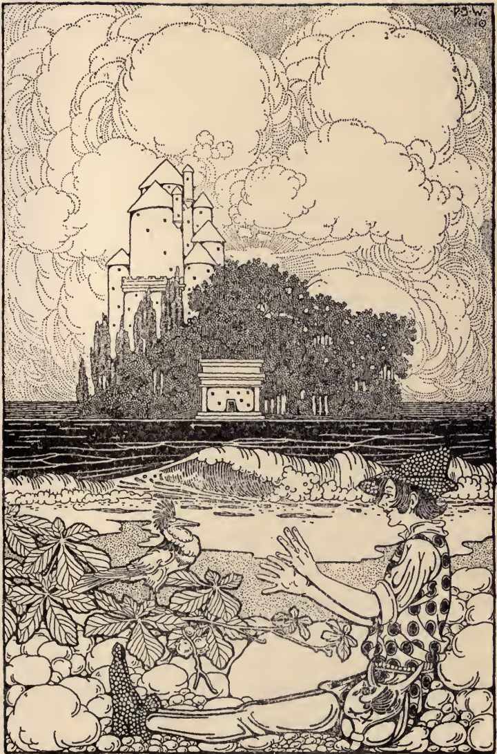
“Ernan is Lord, is Lord of the Fair Islands.”