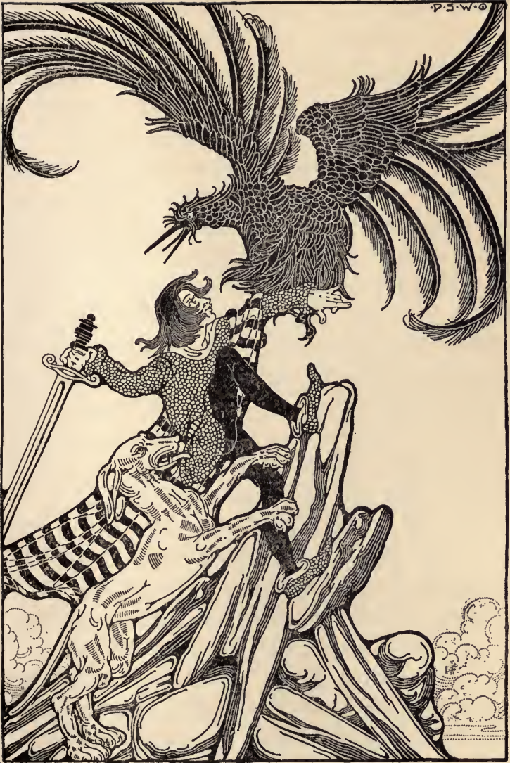
All flew from the mountain except one bird and he was the greatest amongst them all.