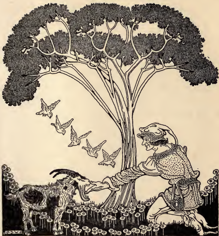
The Hen-wife's Son and the Princess Bright-brow