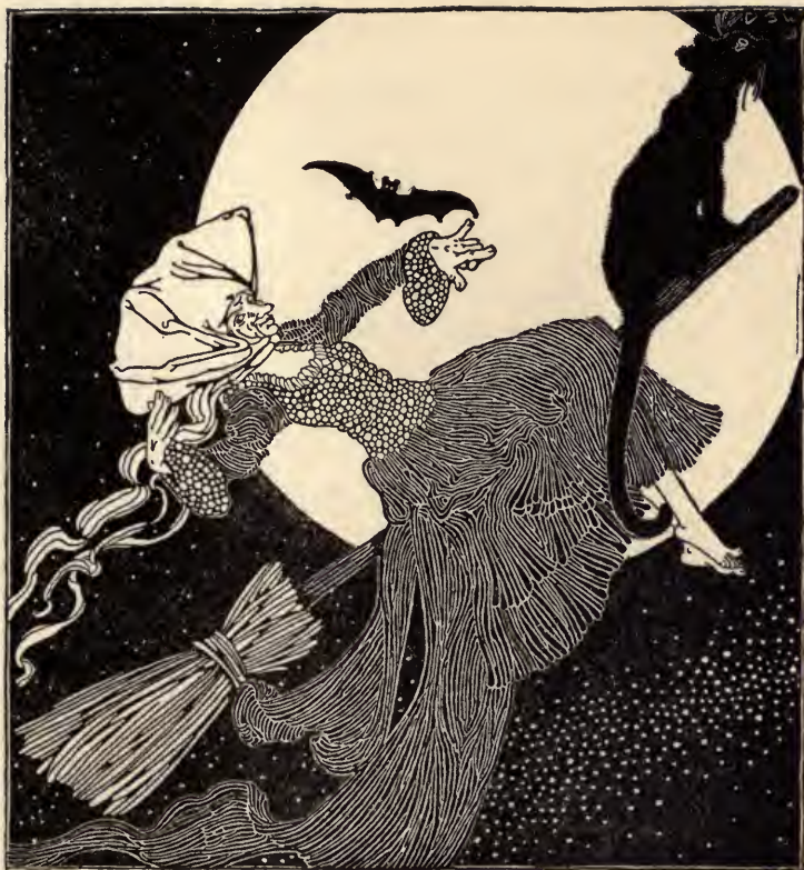
Bloom-of-Youth and the Witch of the Elders