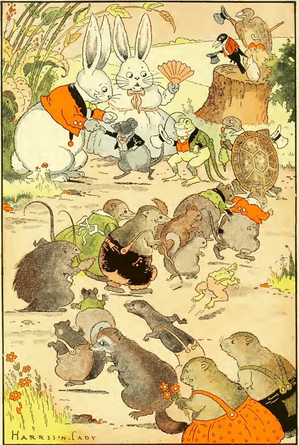
EVERY ONE WHO COULD WALK, CREEP, OR FLY HEADED FOR THE OLD BRIAR-PATCH. Frontispiece. See Page 143.