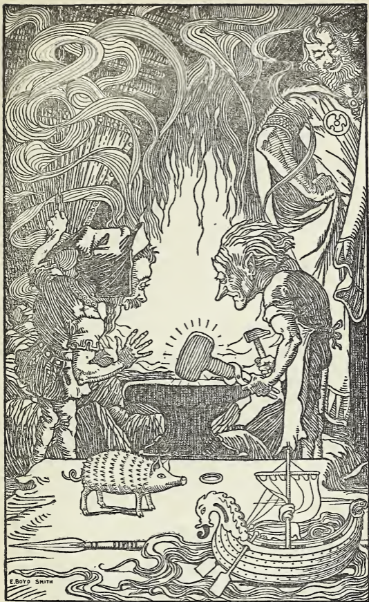
THE THIRD GIFT — AN ENORMOUS HAMMER