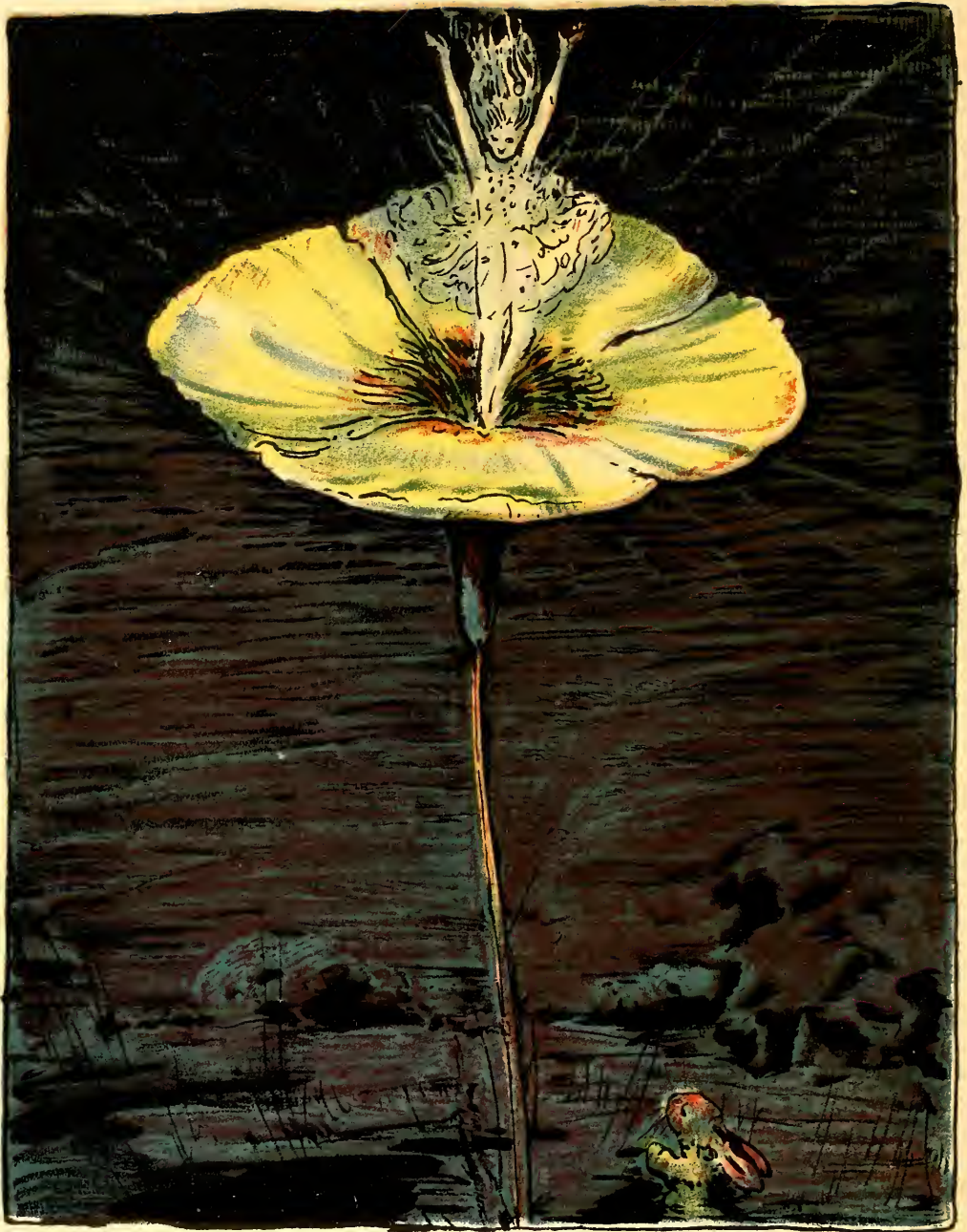
The Fairy flower