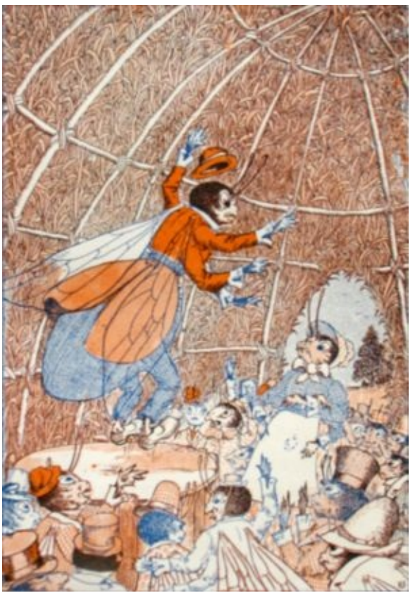
Buster Shouted For Everybody to Keep Quiet. (Page 48)

After a while the uproar ceased. But even then Buster Bumblebee was in no hurry to leave his shelter.