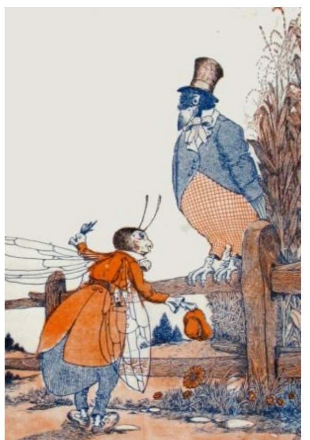
Buster Thanks Old Mr. Crow For His Advice. (Page 25)

"Where can I find Mr. Crow?" Buster Bumblebee asked.