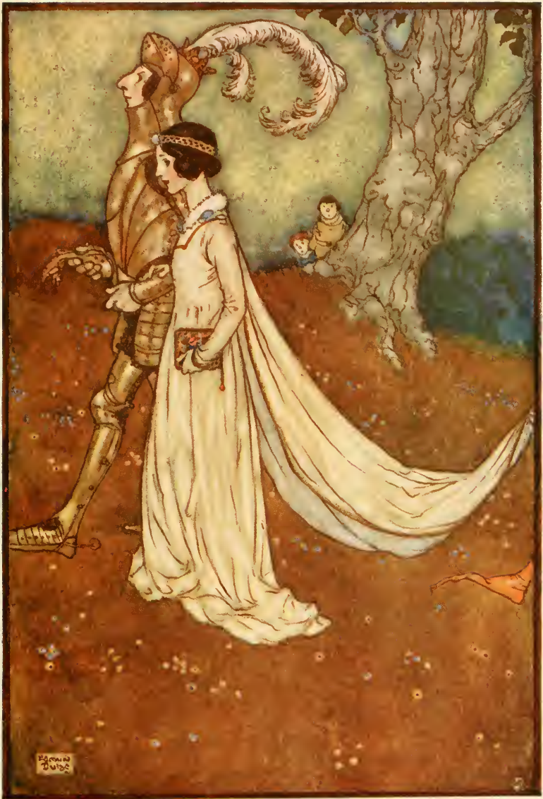
OF COURSE THE DEAR PRINCESS . . . . WORE THE GREAT OPAL ON THE DAY THAT SHE WAS MARRIED