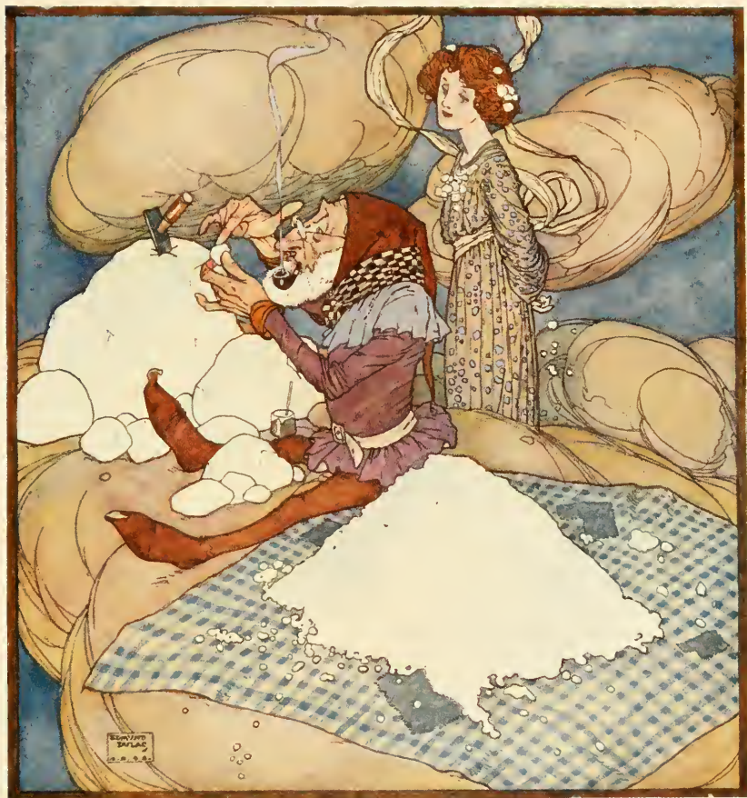
DROP-OF-CRYSTAL WAS TOO BUSY TO SPEAK