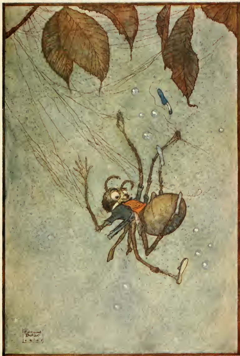
THE WEB AND THE DIAMONDS AND THE BIG SPIDER HIMSELF ALL FELL TO THE GROUND