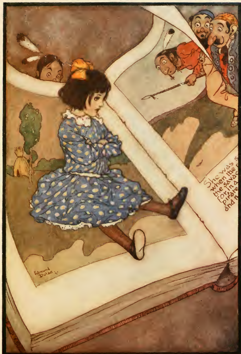
THE OTHER PEOPLE IN THE BOOK LOOKED AT HER IN SURPRISE