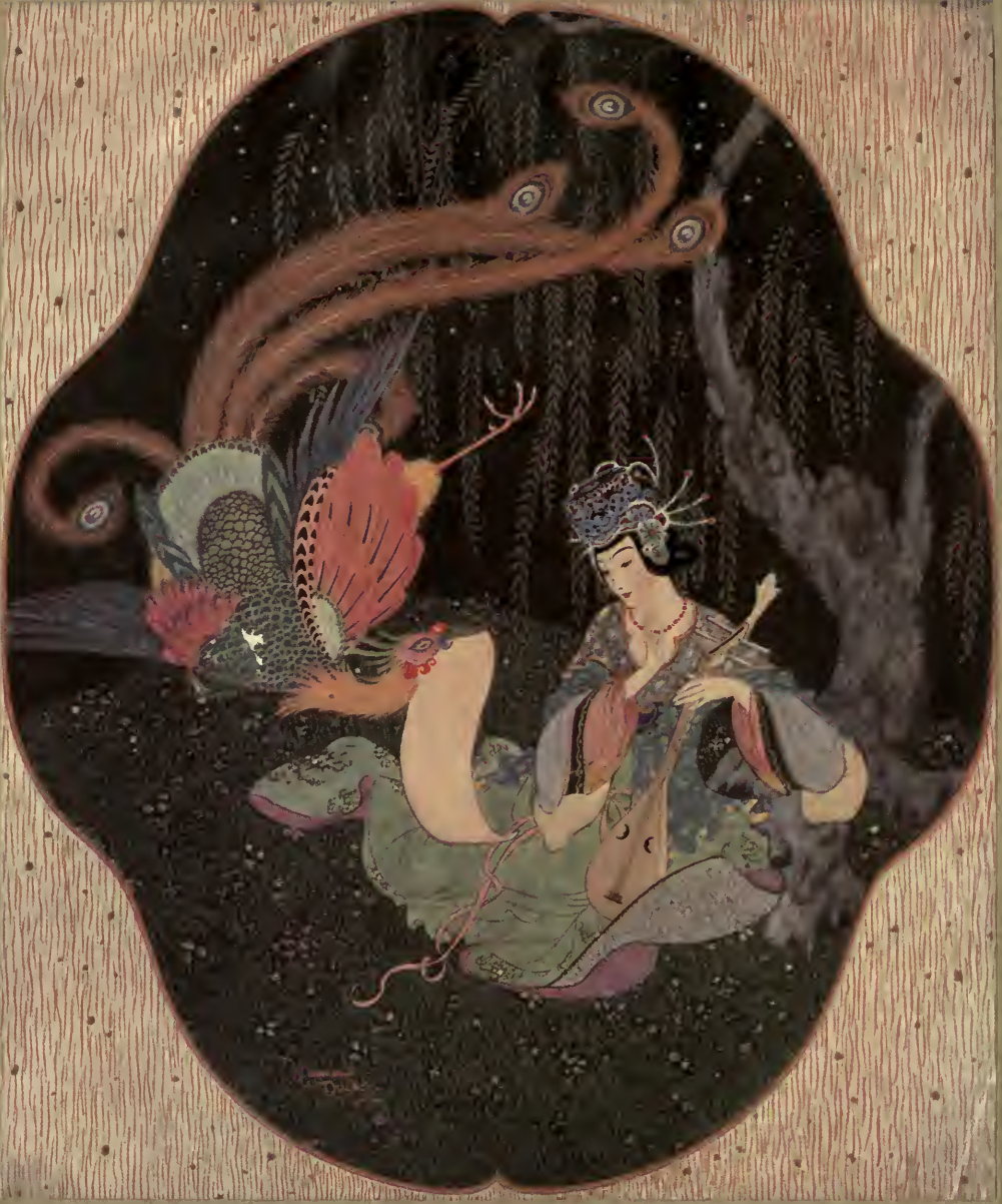
THE WONDERFUL BIRD, LET A BIRD OF MANY COLOURS COME DOWN FROM HEAVEN, MIGHTY BEFORE THE PRINCESS, DROPPING AT HER LEFT THE PORTRAIT —