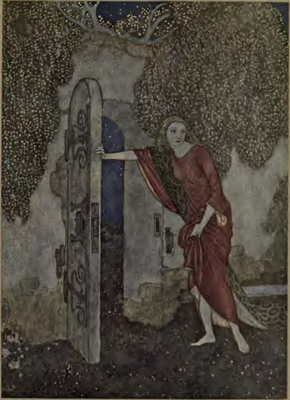
BUT NICOLETTE ONE NIGHT ESCAPED