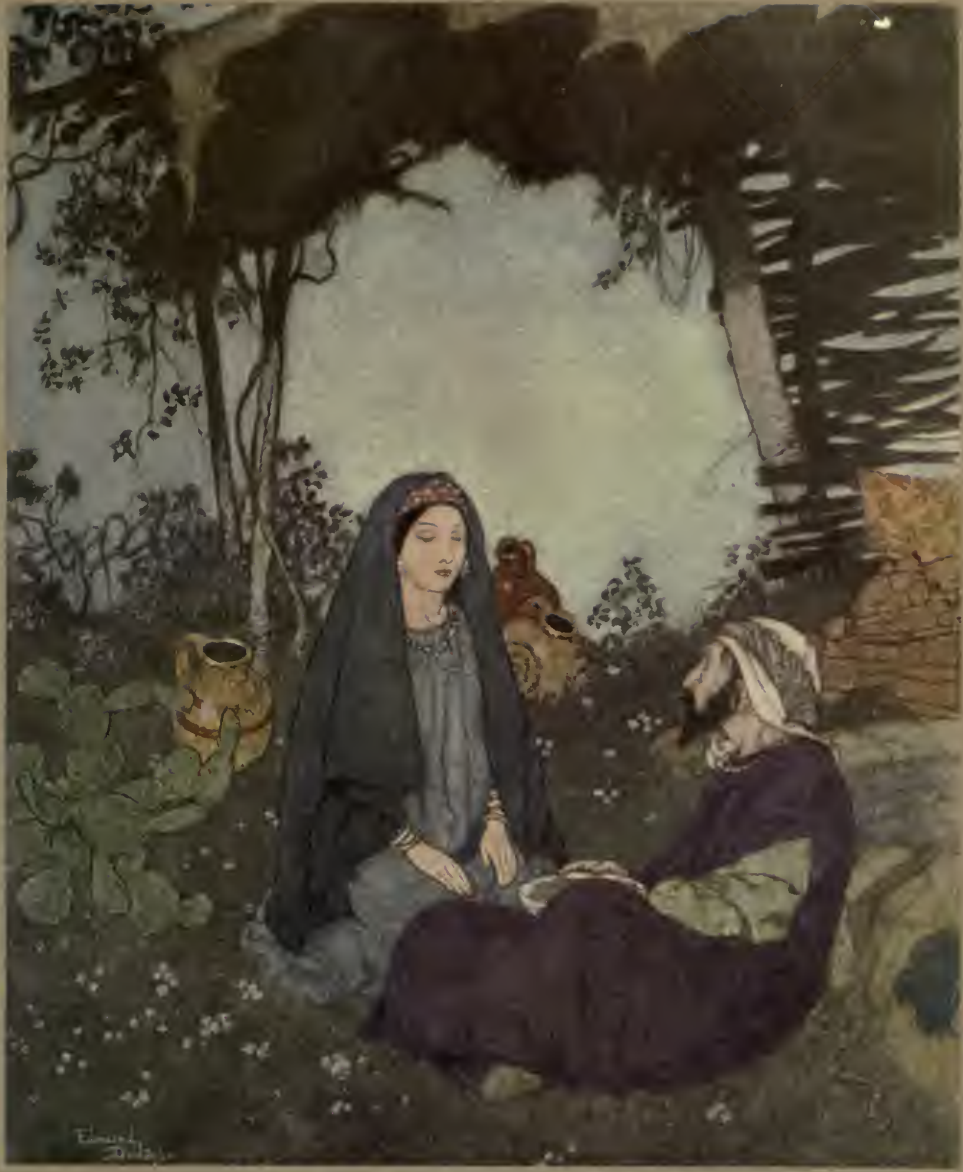
IF THE DESERT WERE MY HOME—THEN WOULD I LET THE WORLD GO BY