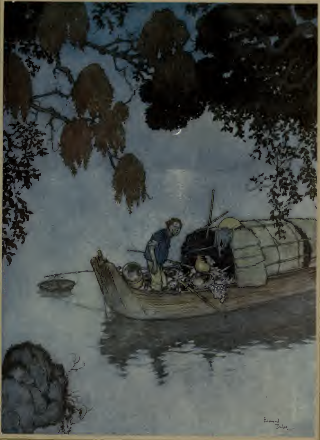
EVEN THE POOR FISHERMAN WOULD PAUSE IN HIS WORK TO LISTEN