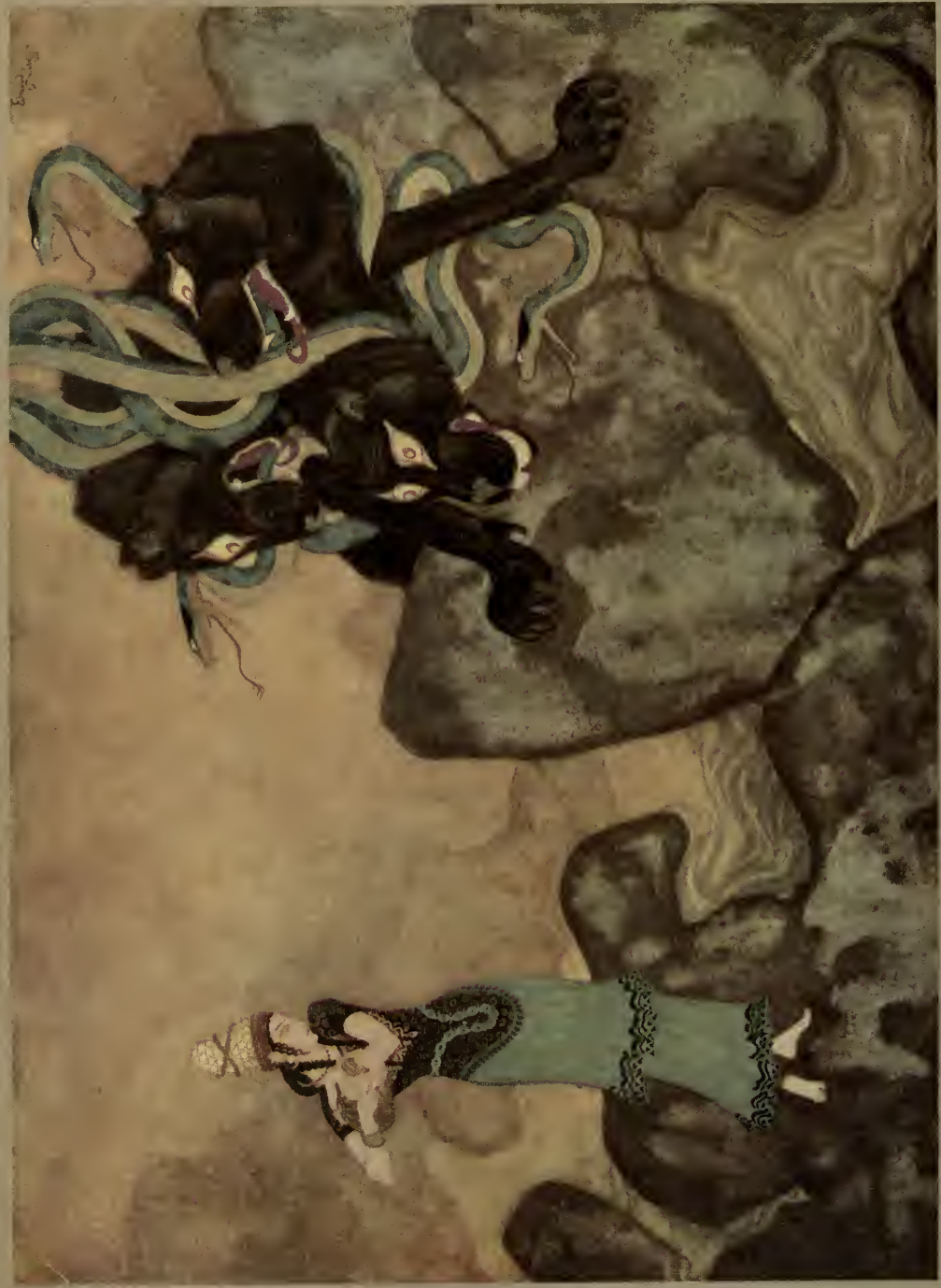
CERBERUS, THE BLACK DOG OF HADES.