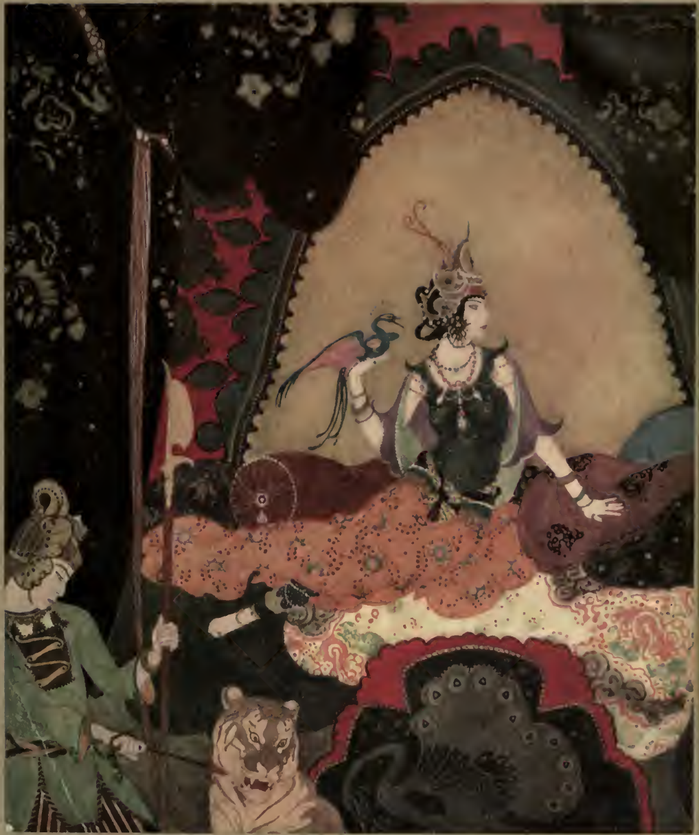
THE MIGHTY SIR BOW BODHS, WITH THE BIRD PERCHED ON THE BACK OF HIS HAND, LISTENING TO ITS SOFT INTONATION OF THAT ONE WORD - "MAJRON"