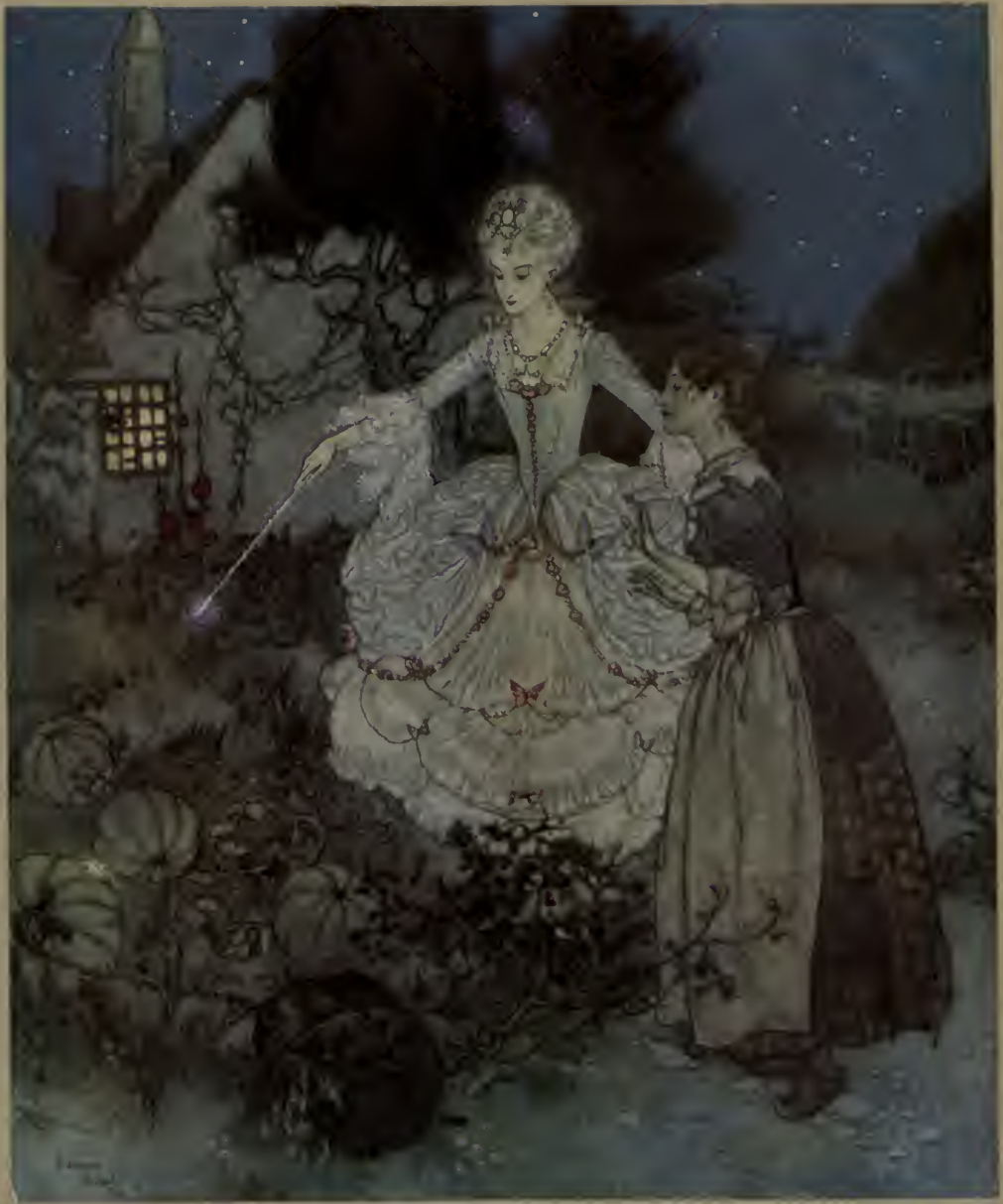
“HERE, SAID HER GODMOTHER, POINTING WITH HER WAND . . . PICK IT AND BRING IT ALONG.”