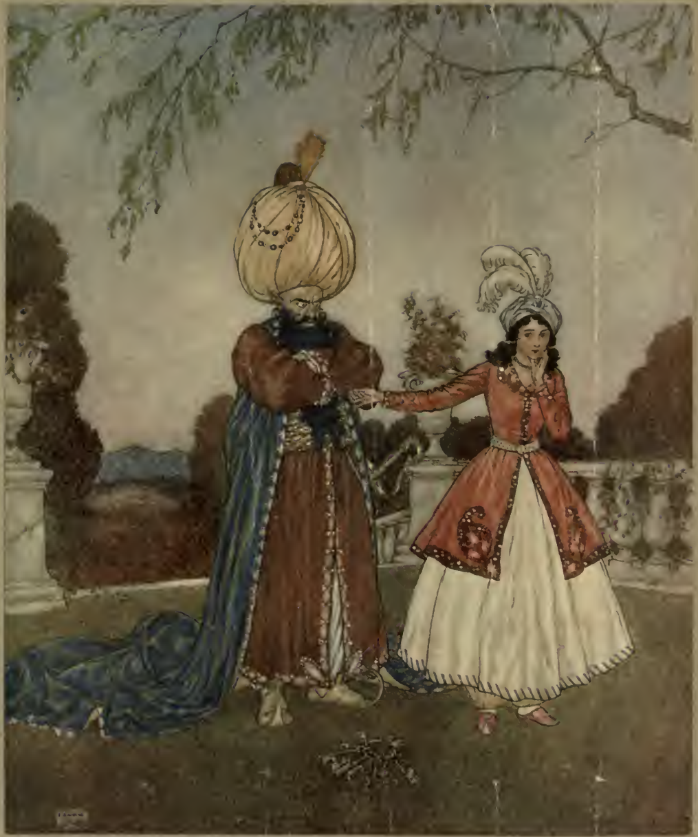
SEVEN AND ONE ARE FIGHT, MADAM.